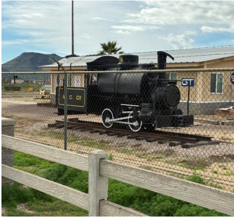
Arizona Copper No. 4 "La Nena" 0-4-0 saddle tank on static display in Glendale, AZ.

Ken Howard's Christmas trip to Arizona was a little light on real railroad action, but small gems sometimes pop up like the two preserved yard goats in the Phoenix area.