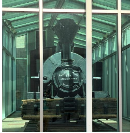
Davenport Locomotive Works 0-4-0 saddle tank on display in downtown Phoenix, AZ