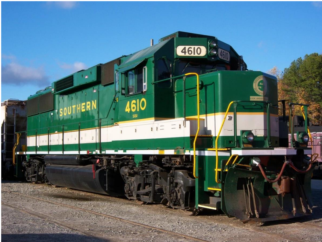
Norfolk Southern 4610 in its distinctive Southern Railway commemorative paint scheme