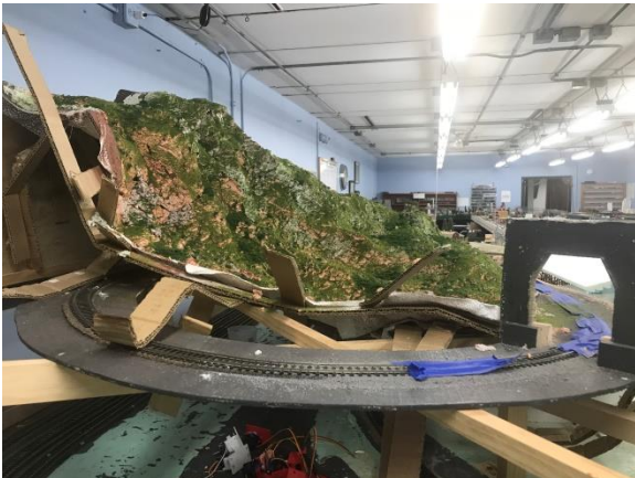
The collapse when water caused the cardboard framework to collapse. Repairs have been completed.