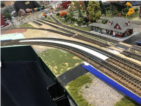
Detail view of new Main #1 double track connection between the legacy modules and the extension