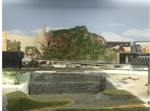
Mount Witwer after the work session.