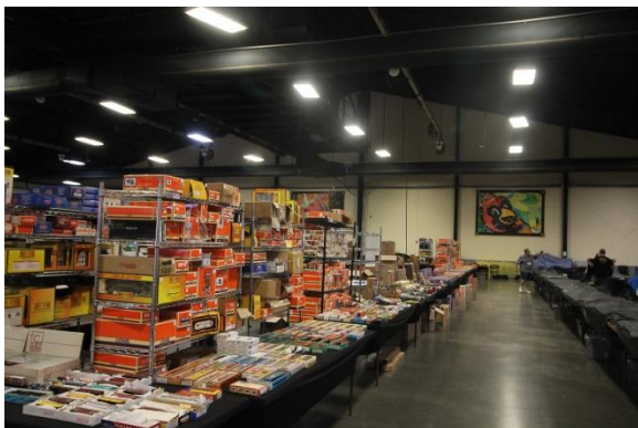
Lots of vendors and merchandise.