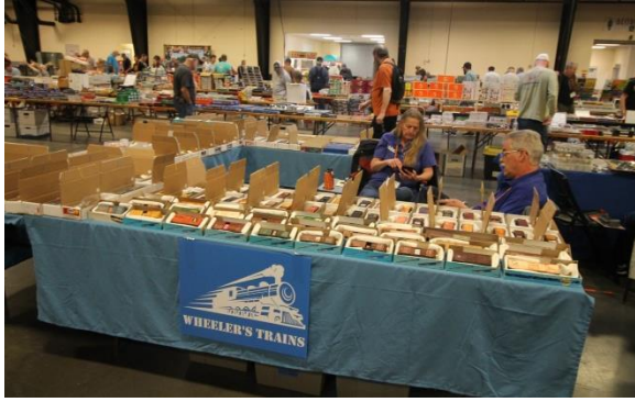
Wheeler's Trains display of merchandise.