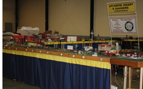
Atlantic Coast S Gaugers layout.