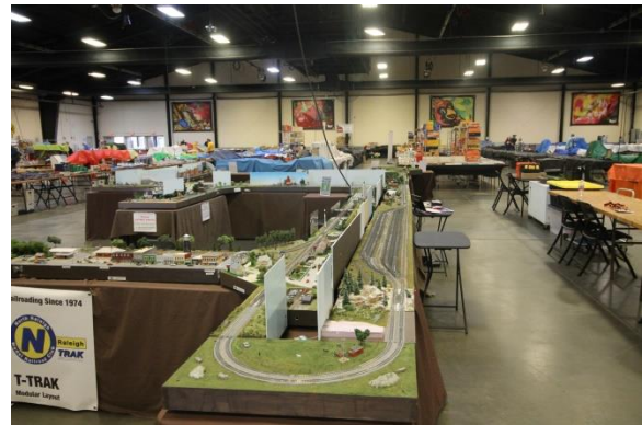
North Raleigh N-TRAK layout.