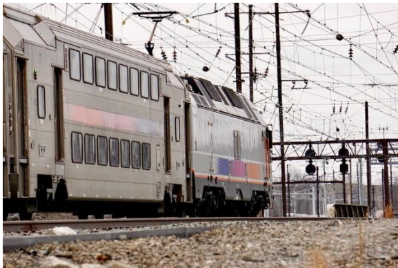
NJT at Morris Tower, PA.