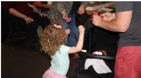
Kids got to participate in raffle ticket box stuffing.