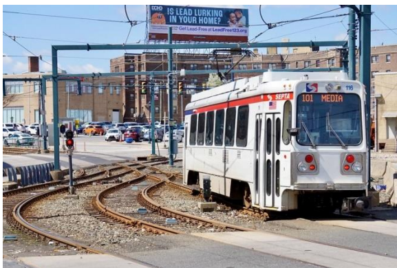
SEPTA Light Rail at 69th Street Terminal in Philadelphia, PA.