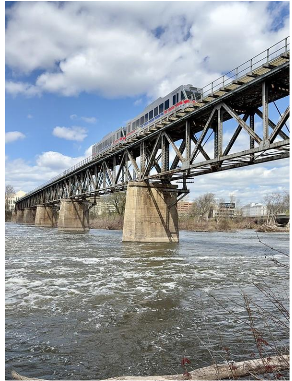
SEPTA Two Car Norristown High Speed Line.