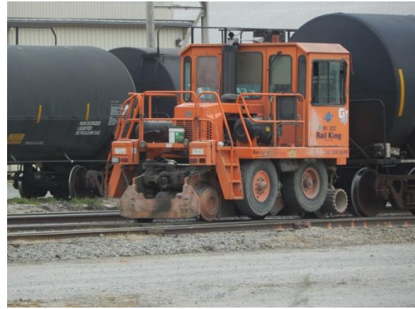
Rail King RK320 yard goat switching at Bailey Feeds in Selma, NC on April 15 th .