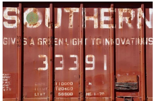
Southern Box Car at the South Carolina Railroad Museum