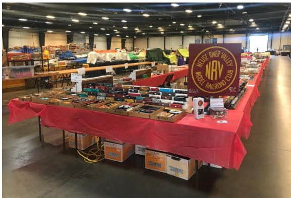
Club Sales Table ready to go on Friday at 11:38 am, a new record.