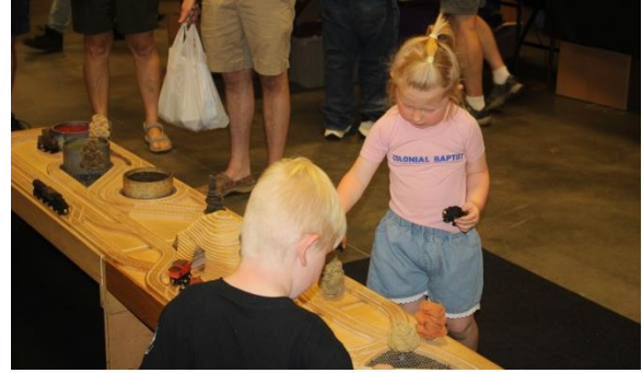
Kids enjoyed playing with the wooden trains from Wilmington Railroad Museum.