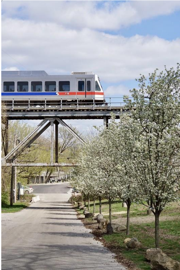
SEPTA Norristown High Speed Line in Norristown, PA