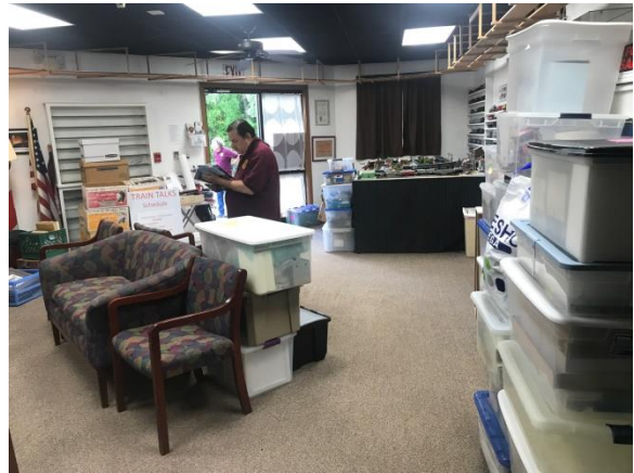
Lots of empty boxes returned and got stacked in the Crew Lounge.