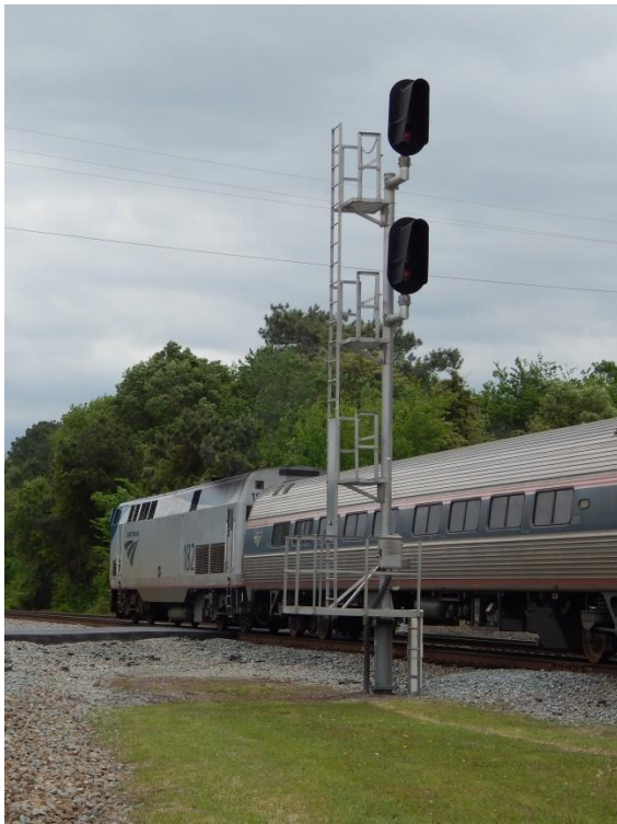
The Northbound Palmetto leaving Selma, NC on April 15 th .