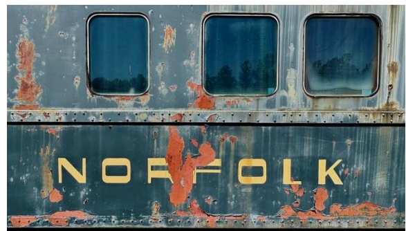
Southern Railway Car Norfolk at the South Carolina Railroad Museum