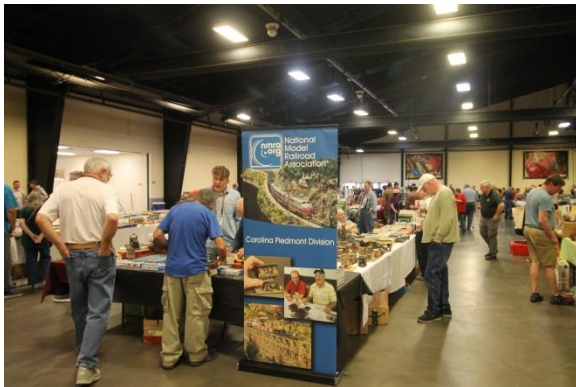
National Model Railroad Association, Carolina Piedmont Division table.