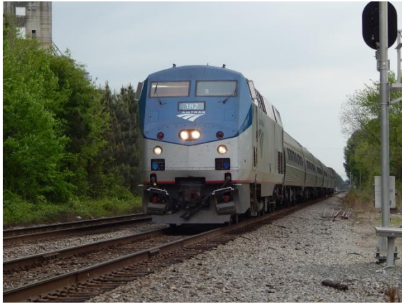
Train 90, Palmetto, arriving at Selma, NC behind Amtrak GE P42DC #182 on April 15 th .