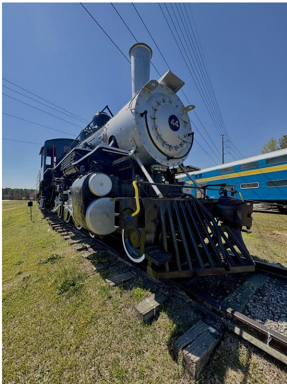
Engine 44 at the South Carolina Railroad Museum