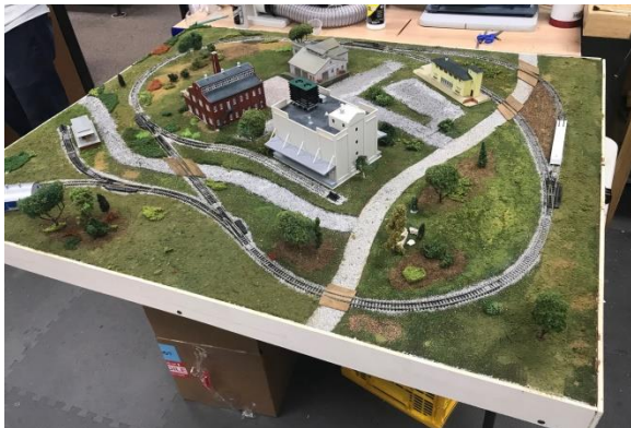
The finished raffle layout in the shop before transport to the fairgrounds.