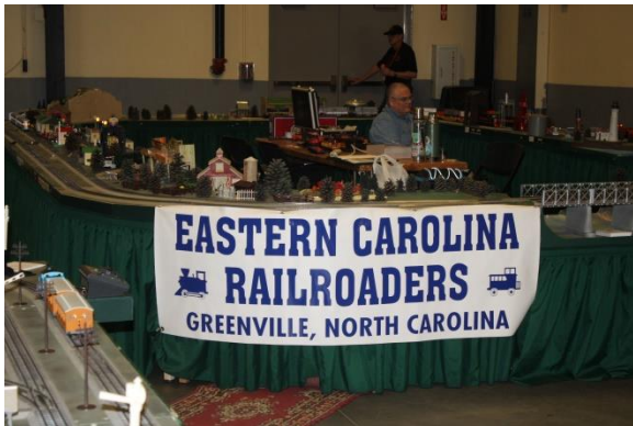
East Carolina Railroaders layout.