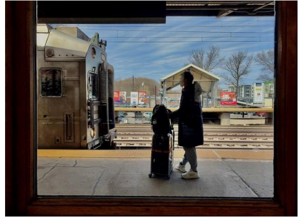
Awaiting departure through the window in Princeton Junction, NJ.