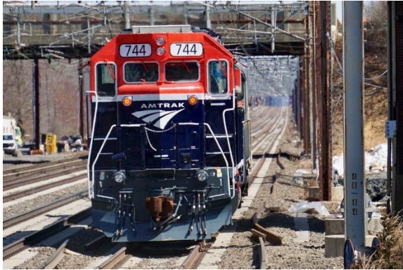
Amtrak 744 GP38-3 at Princeton Junction, NJ.