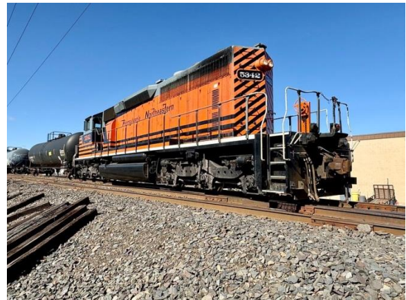
Pennsylvania Northeastern SD40-2W at Ivyland, PA.