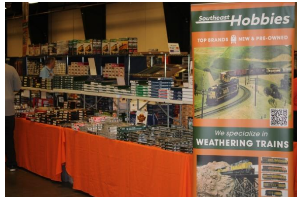
Southeast Hobbies vendor table.