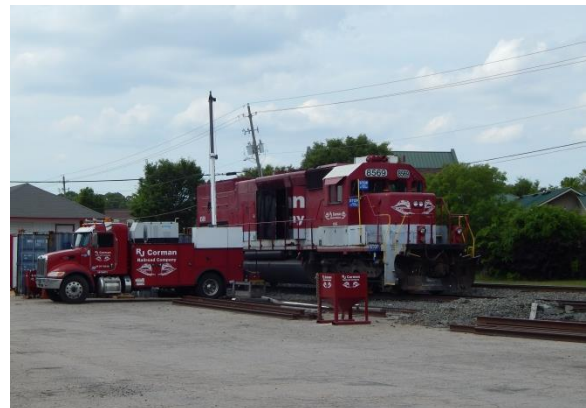
Heavy duty maintenance on RJ Corman SD40T-2 #8529, April 23 rd in Fuquay-Varina, NC.

Amtrak Service through Selma Union Station.