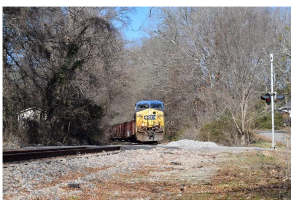
Editor's Note: For you locomotive afficianados, the CSX units in the photos include #16 (GE CW44AC), #542 (GE CW44AH), #714 (GE ES44AH), and #3276 (GE ET44AH).