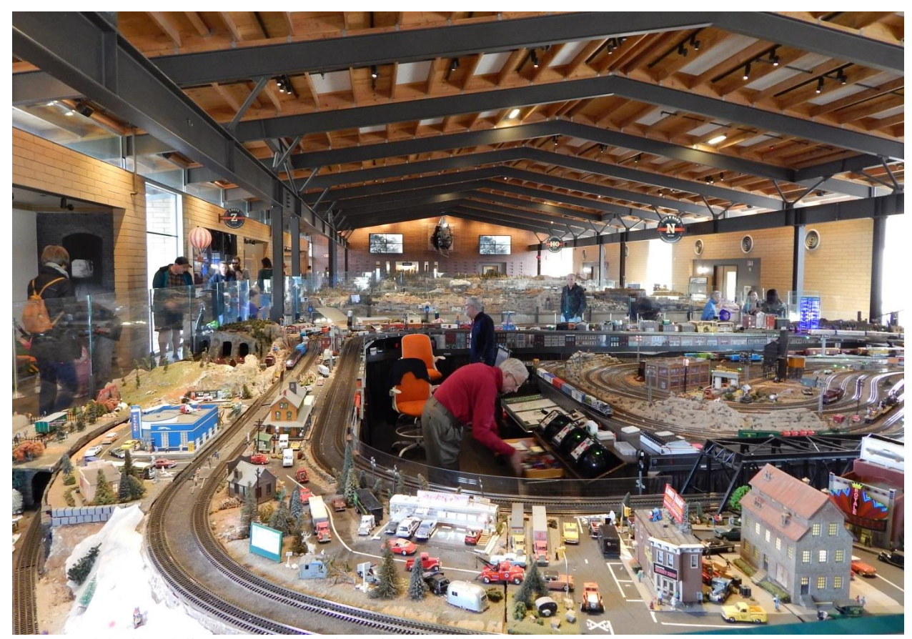
Model railroad displays at McCormick-Stillman Railroad Park, Scottsdale, AZ.