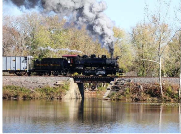
Woodstown Central in Woodstown, NJ.