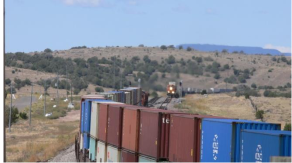
Eastbound and westbound meet.