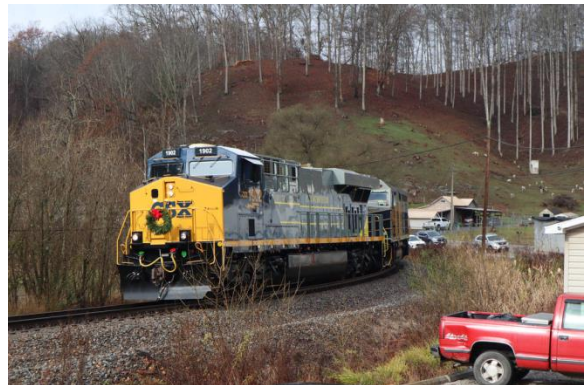
On the outskirts of Dante, VA, the train is greeted by a convoy of chasers wanting to get a look at the lead Heritage Unit.