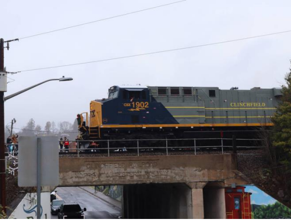
They call this a poetic reunion over the bridge that bears the historic Clinchfield Railroad name.