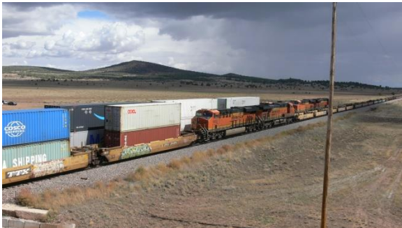
Eastbound and westbound meet.