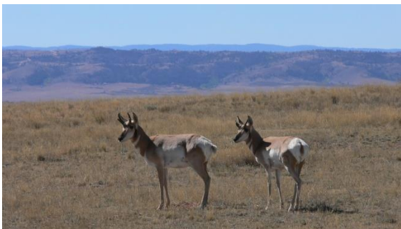
Pronghorns in Wyoming.