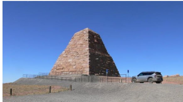
The Ames Monument at Sherman Hill.