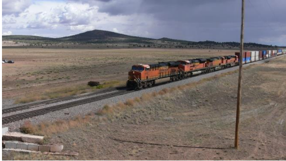
Westbound at old Route 66 (get your kicks) overpass at Crookton, AZ.