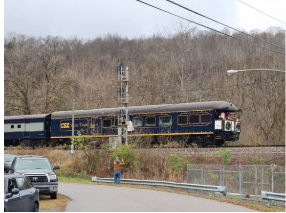
Jolly St. Nick greeting the children, parents, and railfans braving the cold weather at St. Paul, VA.