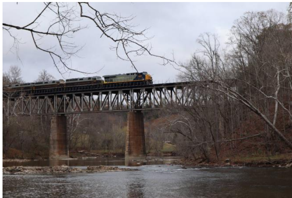
The Santa Train embarks on her final leg pass over the Holston River in Kingsport, TN.

You may remember Santa's Reindeer, Dasher, Dancer, Prancer, Vixen, Comet, Cupid, and the most important one, Rudolph. But whenever he's going down the Clinchfield, he uses three flashy F40s, and this year, a very special Yellow-Nosed Reindeer painted in honor of the Clinchfield Railroad.