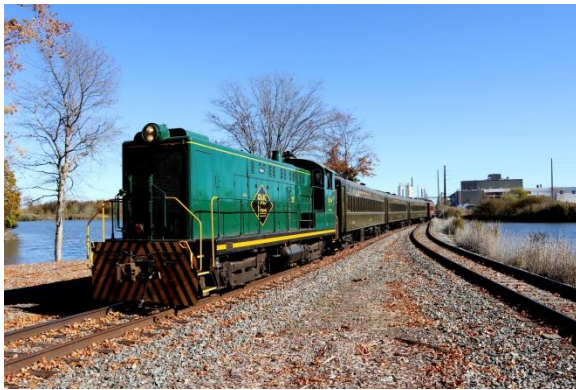
SMS Baldwin S12 304, Mannington Mills, Salem, NJ.