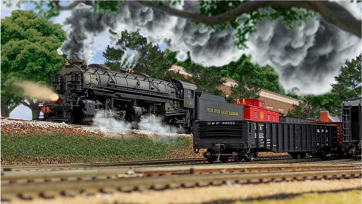
Photo Shopping the HO Layout