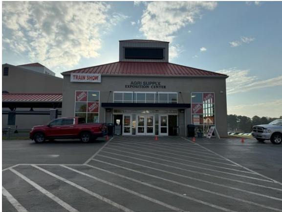
Note the banner.