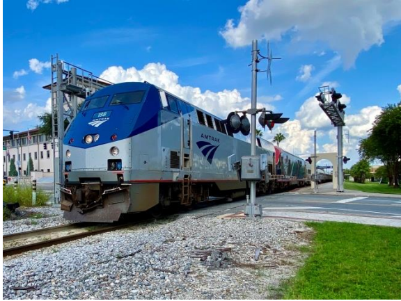
Silver Star at Lakeland, FL,