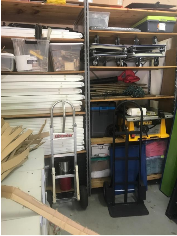
The show and general Club storeroom.