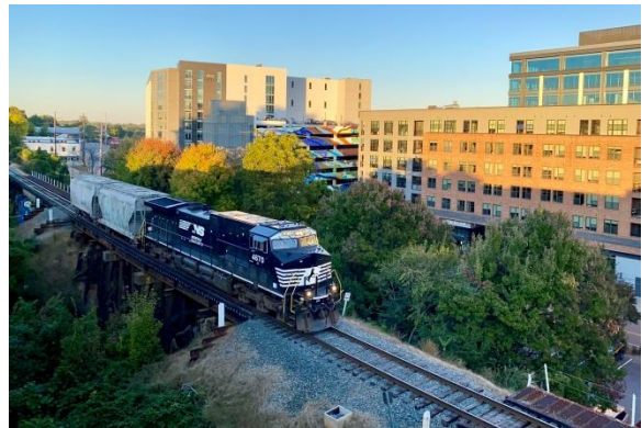
NS 4670 on the former NS.