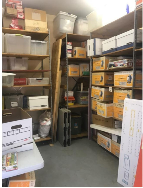
The Board storeroom.