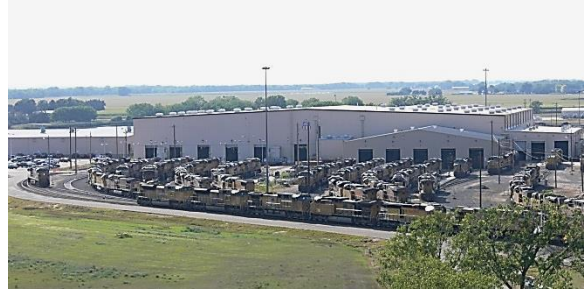
East side of the diesel shop.