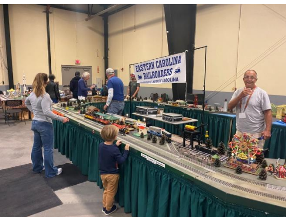
East Carolina Railroaders S-scale layout.