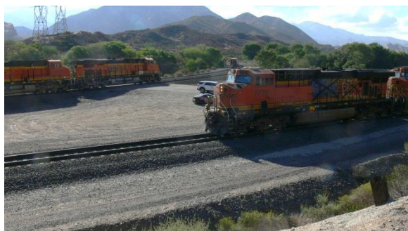
Eastbound on track 2 (left) and westbound on track 3 at Cajon Station.