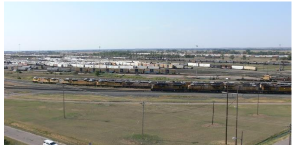
Locomotive ready track