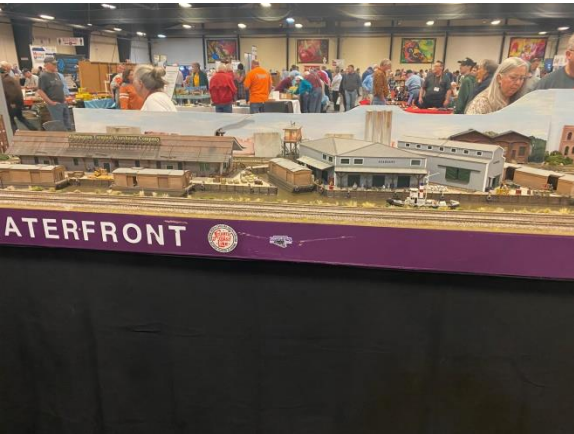
Wilmington Railroad Museum layout detail.