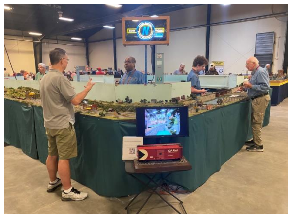
North Raleigh NTrak layout (photo by Bob Witwer).