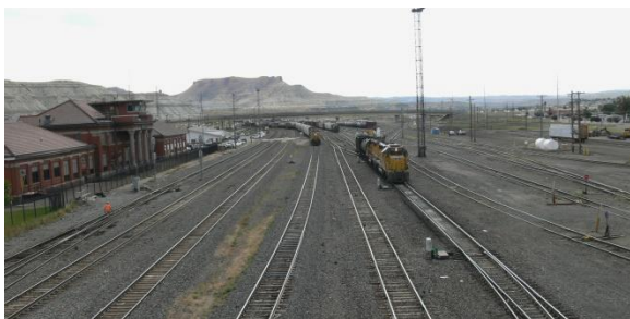
Green River Depot and outbound freight.