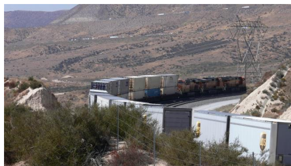
Westbound at Cajon Pass summit.