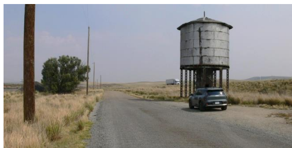
The TTS mobile at the water tank.