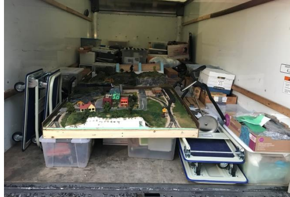
The final load that went to the show.