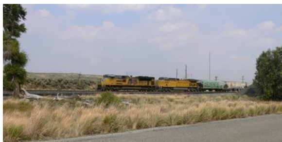
Westbound freight heading for Echo Canyon.