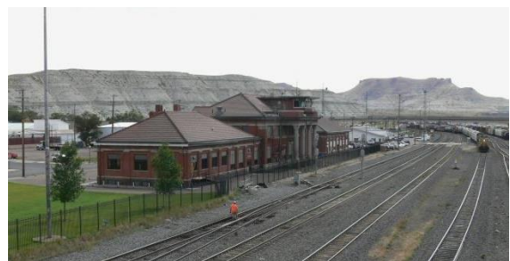
Close up of Green River Depot.