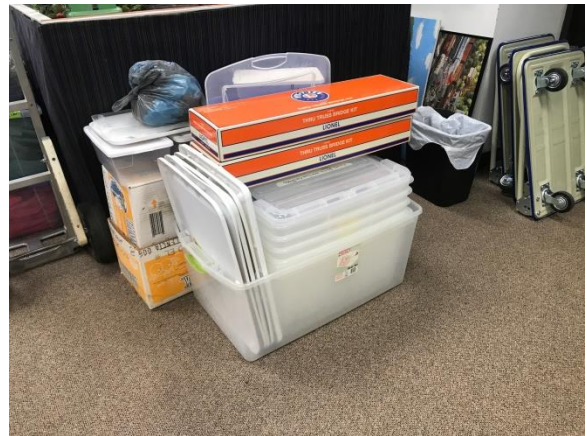
What didn't come home- lots of empties.