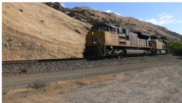
Westbound in Caliente Creek narrows.