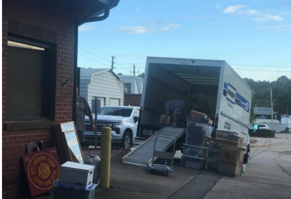
Stacked boxes waiting for loading in the truck.