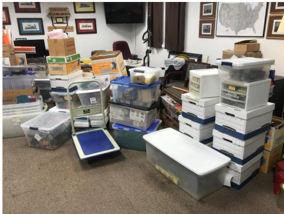
Most of what made it back to the Clubhouse.