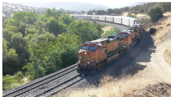
Westbound at Rowen.