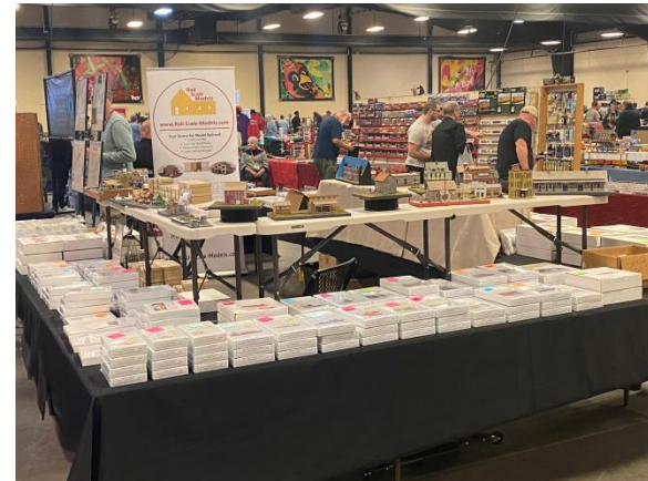
Rail Scale Models vendor table.