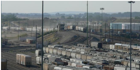
Eastbound hump yard.