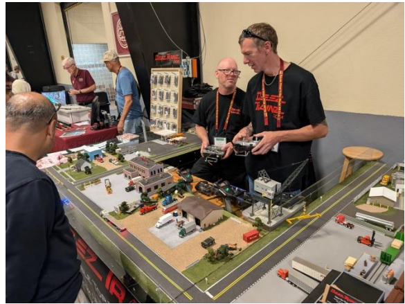
The HO truck layout was popular.