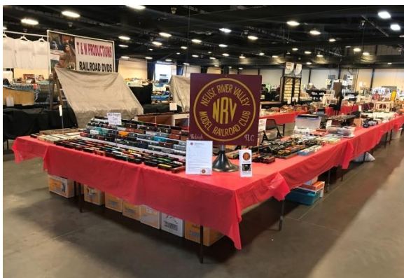
Club Sales Table.