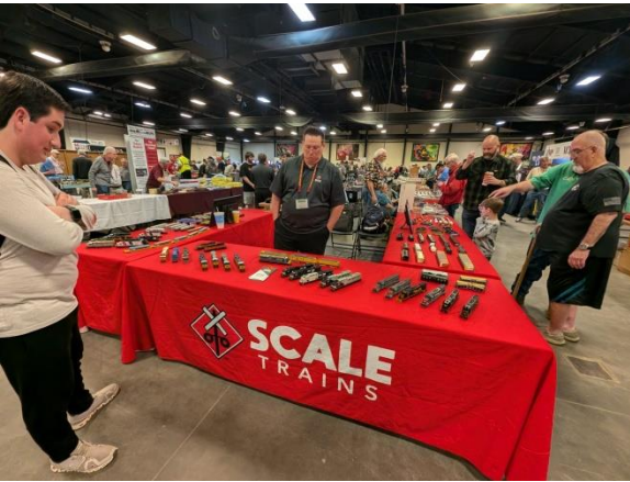
Show sponsor Scale Trains display.

Lots of layouts, vendors, sponsors, and new additions to the show: