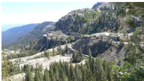
Original 1866-67 snow sheds on abandoned line. Current line goes beneath Mt. Judah through Tunnel 41.