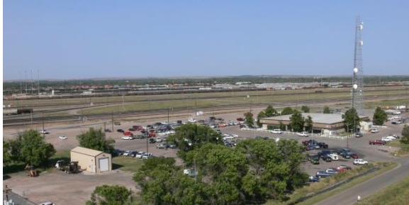
View from the Golden Spike Tower.