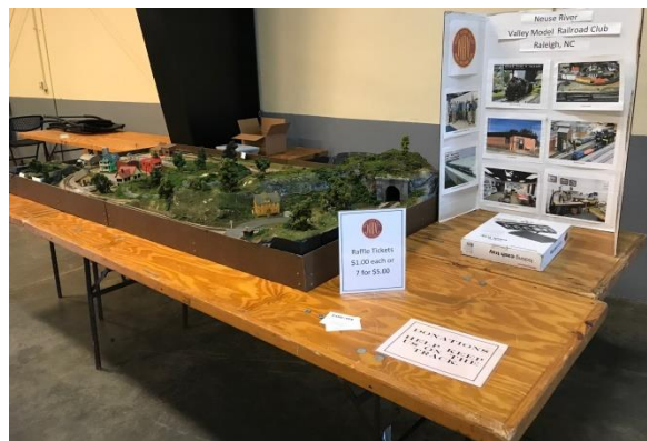
The Club Raffle Layout.