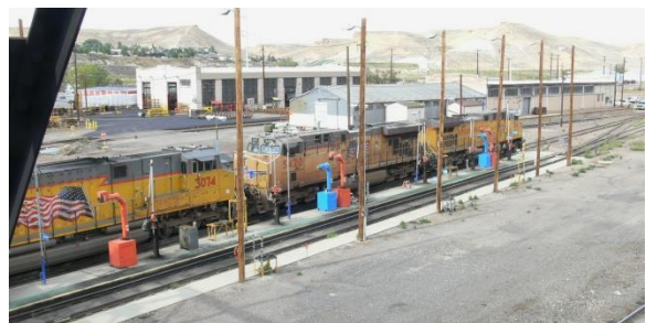
Locomotive service tracks.