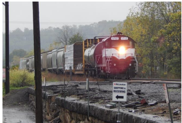
Everett Railroad is also a Class III common carrier. Here EMD GP16 number 1712 hauls freight out of Duncansville, PA.