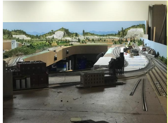
Overview of the N scale layout.