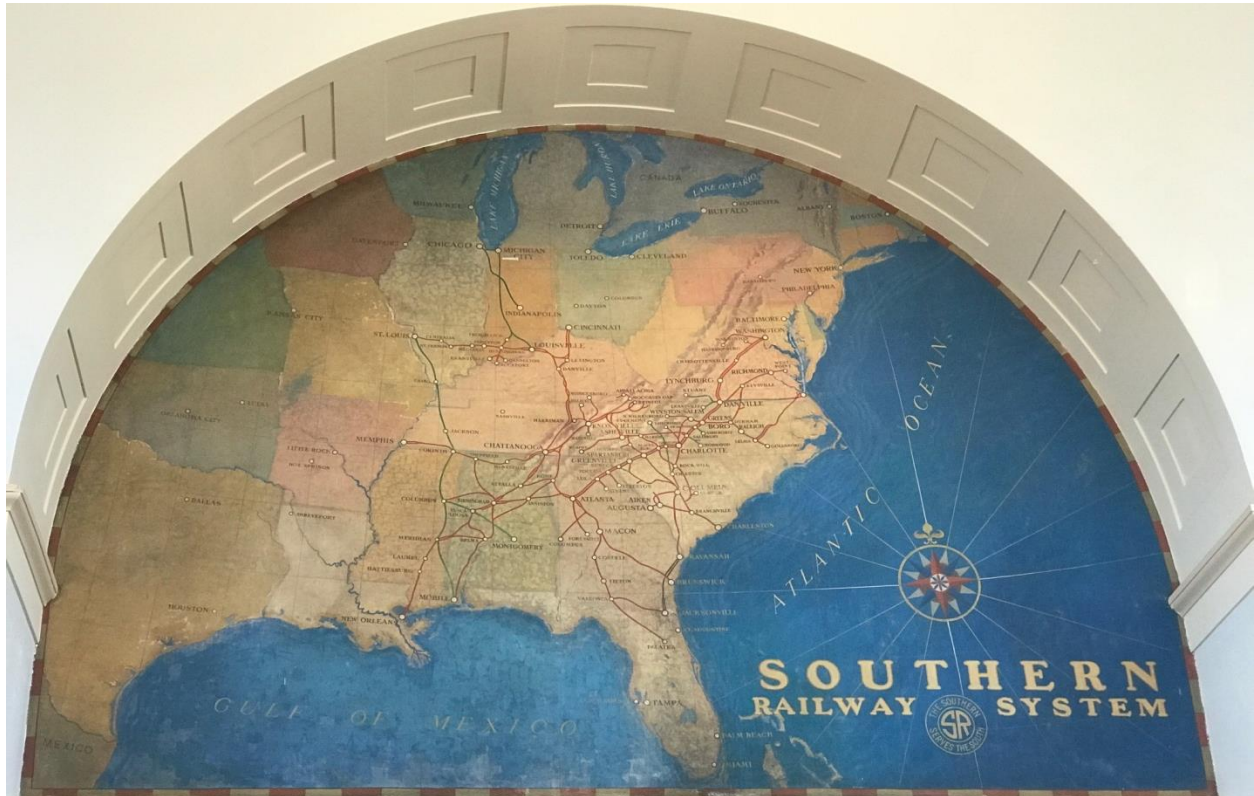
Preserved Southern Railway System route map in the Greensboro depot.

Many thanks: to the members of Carolina Model Railroaders who hosted and gave us great guided tours of their HO and N scale layouts and the National Railway Historical Society Museum. We greatly appreciated their time and efforts. The visit was thoroughly enjoyable, and we always come away from touring other clubs with modelling and operational ideas.