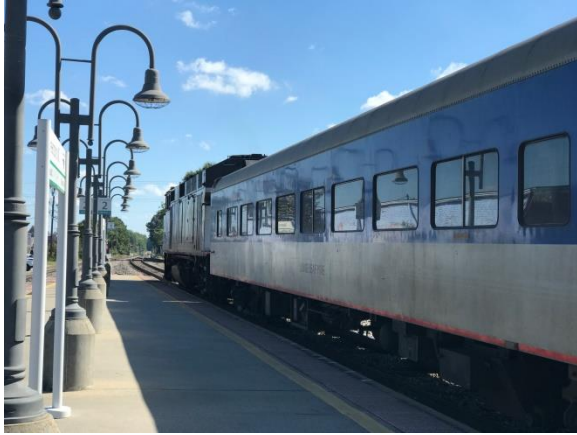
Arrival at Greensboro.