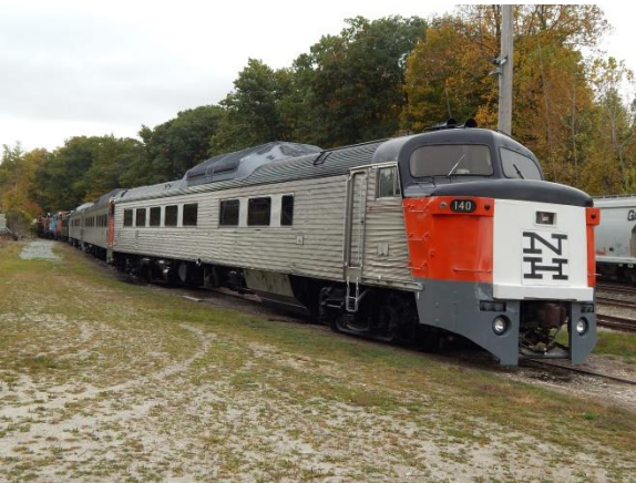
New Haven Budd RDC number 140, the Roger Williams Train, leased to the museum by Budd RDC Foundation and operated as a tourist train by Berkshire Scenic Valley Railway, Lennox, MA.