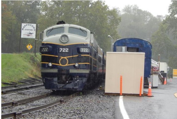
Baltimore & Ohio EMD F7A on Potomac Eagle Scenic Railroad in Romney, WV.