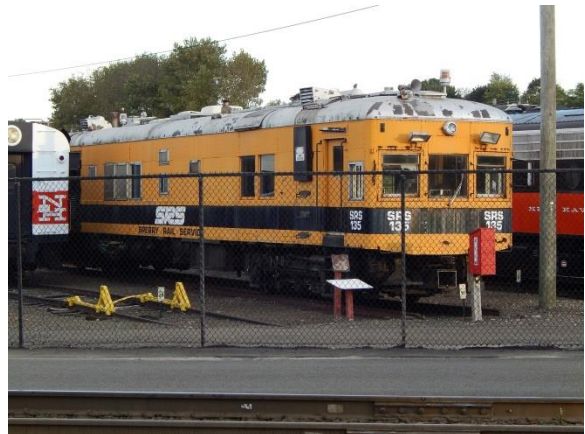
Sperry Rail Service Car 135 at the Danbury Railway Museum in Danbury, CT.