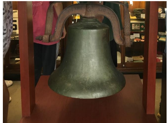
Bell from the old 97.