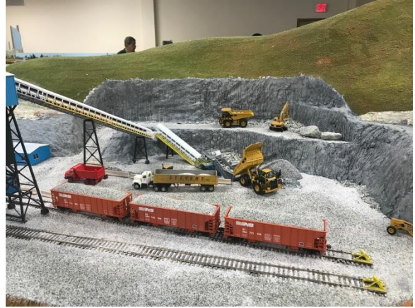
Detail of the stone quarry.