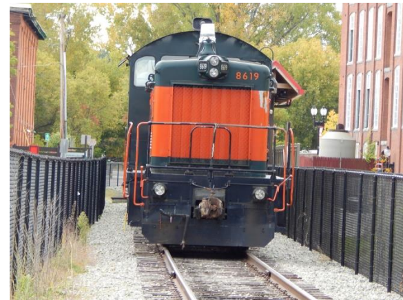
Berkshire Scenic Railway Museum EMD SW8 number 8619 ready to take a tourist run out of the depot at Adams, MA.