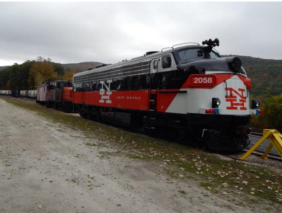
New Haven EMD FL9 at Berkshire Scenic Railway Museum in Lenox, MA