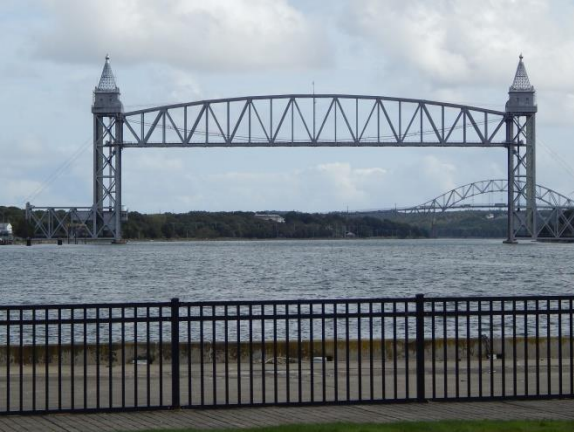
Lift bridge for the Cape Cod Railroad over the Cape Cod Canal. Highway bridge in the background at Buzzards Bay, MA.