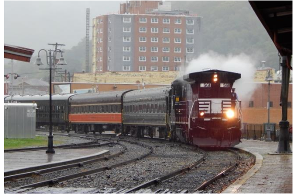
Western Maryland Scenic Railway tourist train arriving in Cumberland, MD.