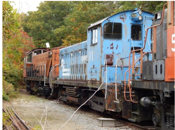
Conrail SW9 number 9128 at Lennox, MA.