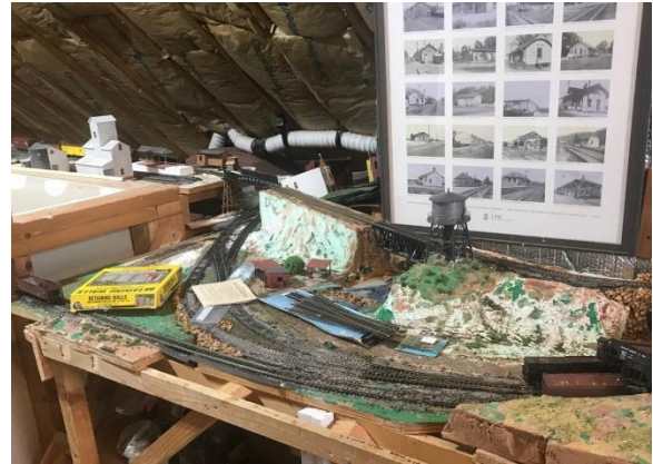
Tom had a complete loop around the chimney vent structure and was in the process of adding a second level.