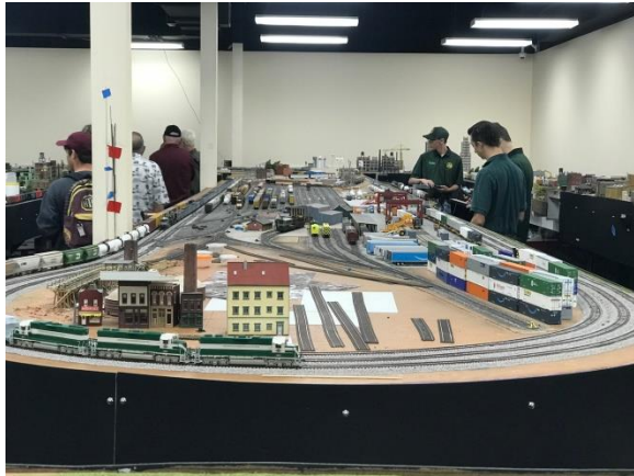
The central portion of the HO layout.