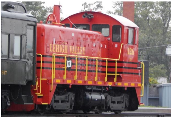
Lehigh Valley SW900m number 126 pulls tourist trains for the Everett Railroad in Holidaysburg, PA.