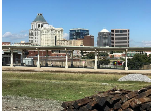
View of downtown from the depot.