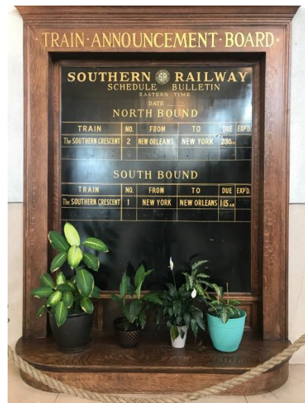
Preserved Southern Railway schedule.