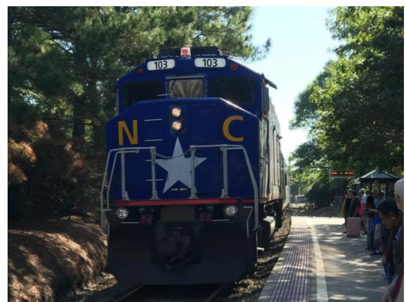
NC DOT 103 leads the Piedmont into Cary.