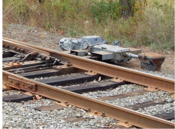
Derail switch to prevent entry when the bridge is raised. Better derailed than submerged in the canal.