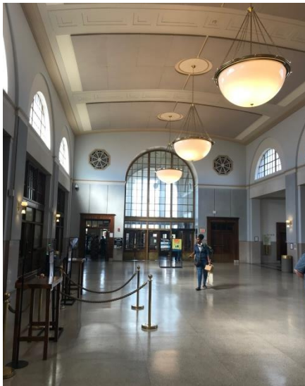
Restored interior of the Greensboro Depot.