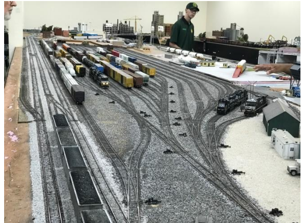
Detail of the yard shown in photo to the left.