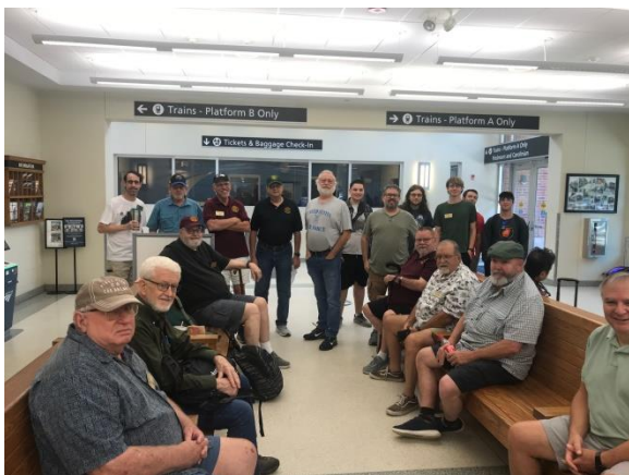
Waiting for the train in the Cary Amtrak depot.

On September 28 th members of the Club rode the Piedmont from Cary to Greensboro to visit the Carolina Model Railroaders' layouts, the NRHA museum, and the restored Southern depot. The group enjoyed lunch in downtown Natty Greene's restaurant.