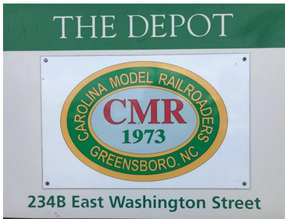
What we went to see.