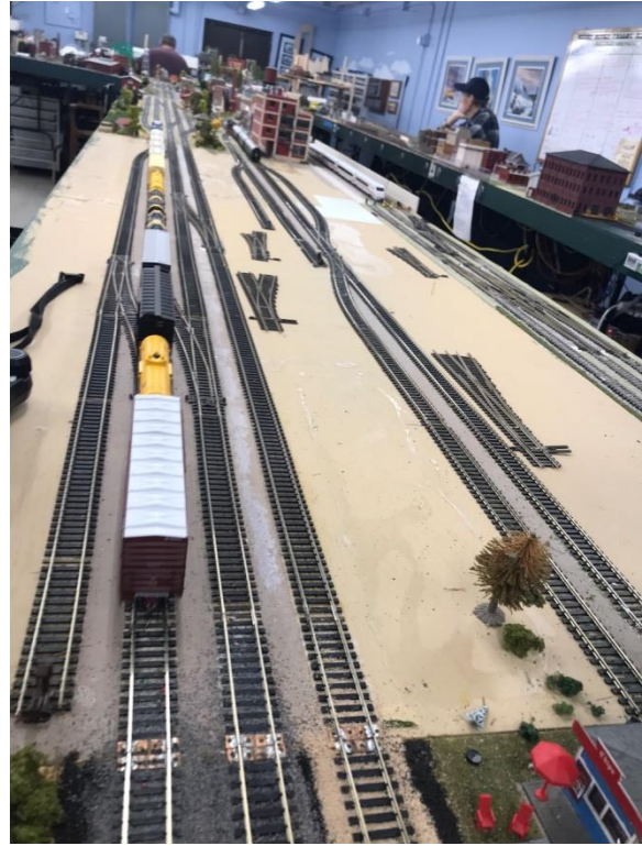
Module 4 is currently a plywood prairie but plans are complete and construction will begin shortly. Mains 3 and 4 will be connected to the interior yard.