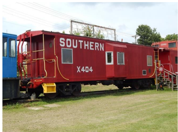
Southern bay window caboose X404 on display at Jackson, MO.