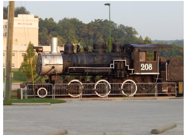
Former Angelina & Neches River Railroad 1912 Baldwin 2-6-0 Mogul on static display at French Lick Station, IN.