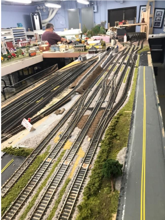
The yard to the left hand side at the base of Main 4 extension is now fully operational. Note the improved road and the beginnings of scenery.

Considerable work has been going into the improvements on the HO layout. The photos follow will give you some idea of the work that has been accomplished as well as the work that remains.