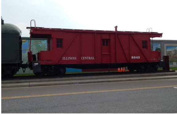
Illinois Central non-cupola transfer caboose No. 8045 on static display along the floodwall in Paducah, KY. Originally built in 1951 as No. 8112