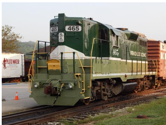
French Lick Scenic Railway EMD GP 9 No. 465 heads the train. Box car houses a generator unit for the passenger cars.