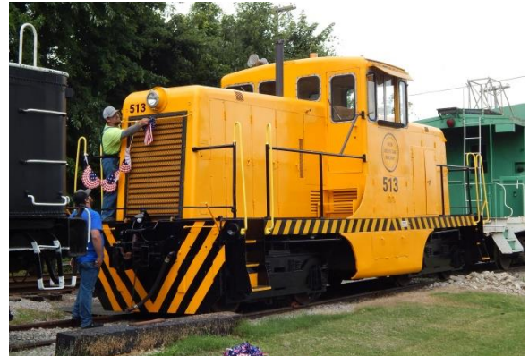
Volunteers removing Fourth of July decorations from 1941 ex US Navy GE 44-tonner 513 at Iron Mountain Railway in Jackson, MO.