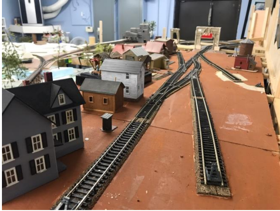
Peter Donofrio has been working on the lumber camp on Main 4 Extension. The sidings are now powered and switch throws have been installed.