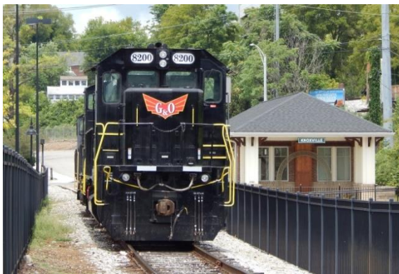
Knoxville & Holston River Railroad No. 8200 in Knoxville, TN. This is a National Railway Equipment rebuild of a GE 4L U-boat. Gulf & Ohio Railways is the holding company for K&HR and Three Rivers Rambler.