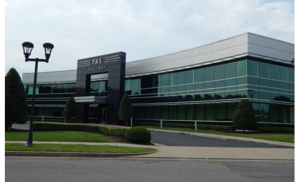
Modern short line railroading must be a going concern based on the new headquarters of the Paducah & Louisville Railway, Inc. in Paducah, KY.