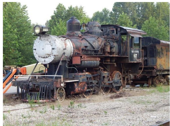
Former Mobile & Gulf Railroad 1925 Baldwin 2-6-0 Mogul is awaiting attention in the weeds near the French Lick, IN station.