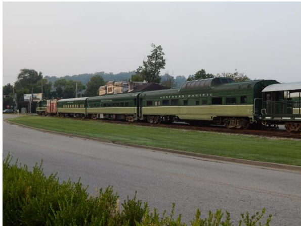
Northern Pacific dome car in the consist for French Lick Scenic Railway tourist train in French Lick, IN