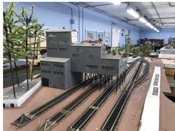
The coal operation on Main 4 Extension is taking shape. All track is down and operational, and switch machines (operated from a new panel on the end of the layout) are also operational.