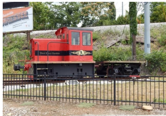
Three Rivers Rambler No. 150, the "John Henry" on static display in Knoxville, TN. The 25-ton GE was originally built in 1943 for Bethlehem Steel Company.