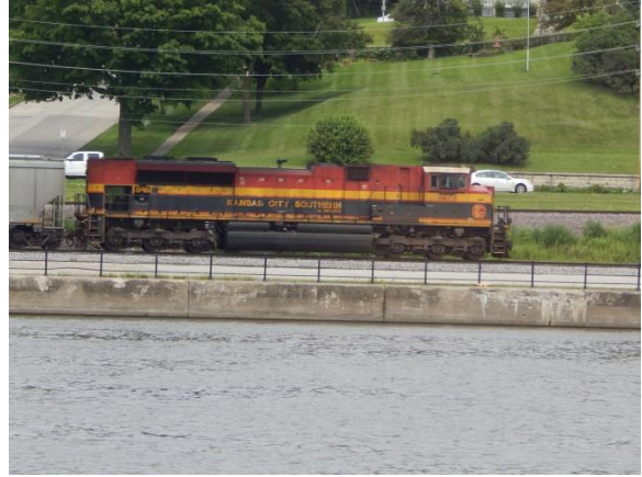
One helper, KCS de Mexico No. 4079, EMD SD70ACe, on the back end of the same train.