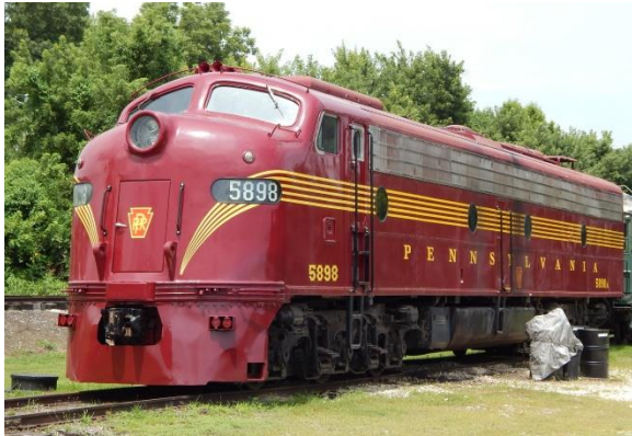
Former Pennsylvania EMD E8 built in 1951 and restored at the St. Louis Iron Mountain & Southern Railroad in Jackson, MO.