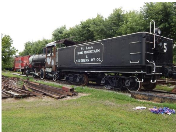
Restoration project 2-4-2 "Columbian" built by H. K. Porter, Inc. as a tank engine in 1946 at St. Louis Iron Mountain & Southern Railroad in Jackson, MO.