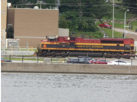
KCS southbound Canadian grain train making time behind EMD SD70ACe no. 4186 on the west shore of the Mississippi River through Bettendorf, IA