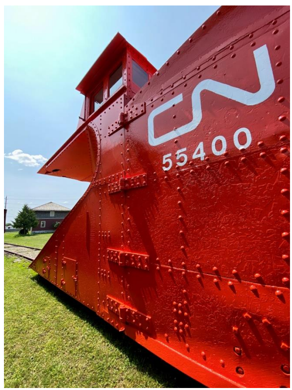
Canadian National Snowplow at Railway Museum of Eastern Ontario (7/27/24).