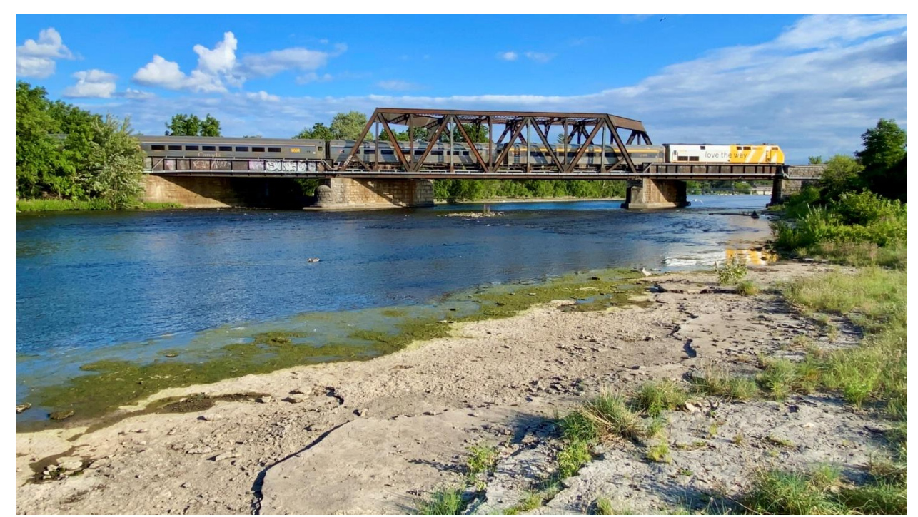
VIA Rail Canada Crossing the Moira River at Belleville, ON (7/27/24).