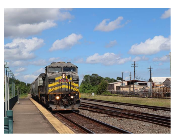
A soon to become rare KCSM Grey Ghost AC44CW passes by Beaumont, TX on a CPKC grain train.