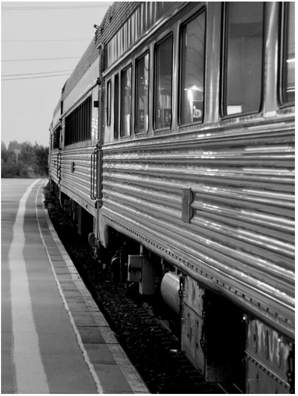
Streamliners at Belleville, Ontario (7/24/24).