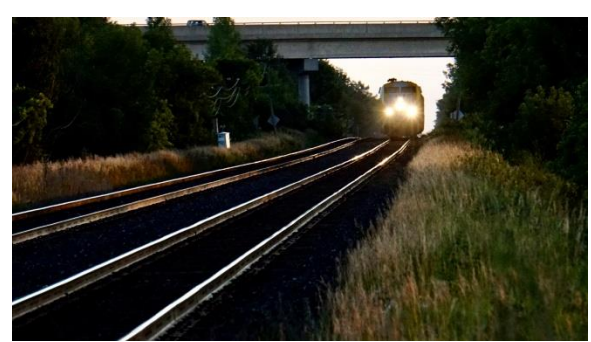
VIA Rail Canada Ocean at Trenton, ON (727/24).