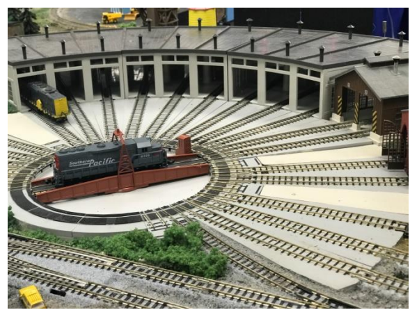
Needless to say, this is a larger module than the average. It's about 2 x 4 feet and features 9 stalls plus a 2 stall adjacent engine shop.