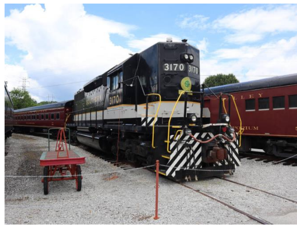
Southern 3170 preserved at the Tennessee Valley Railroad Museum in Chattanooga, TN.