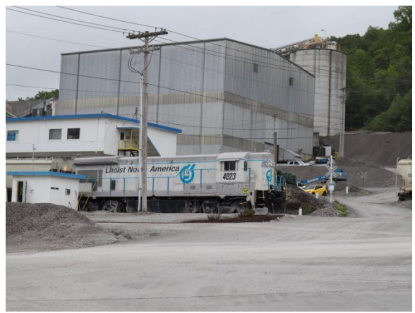
A rare ex-Southern B23-7 switches covered hoppers for Lhoist North America in Crab Orchard, TN.