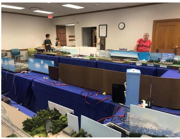
Overview of the modular display.