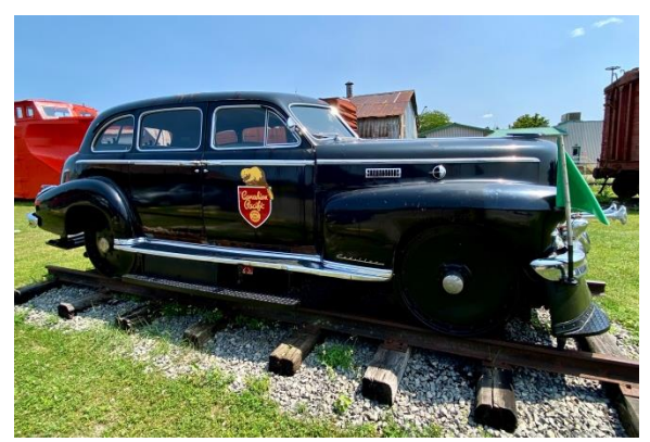
Canadian Pacific Cadillac Inspection Car at Railway Museum of Eastern Ontario (7/27/24).

If you enjoyed Larry Pearlman's photos in last month Whistle Post, savor a new round. These shots are from Larry's trip to Ontario, Canada during late July 2024.