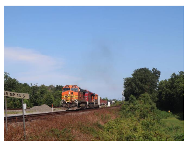
A westbound BNSF manifest with a CP unit second out heads out of New Orleans, LA.