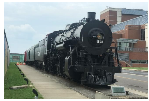
2-8-2 No. 1518 next to the flood walls in Paducah, KY. Built by Lima in 1923, No. 1518 was the last active Illinois Central steam engine.