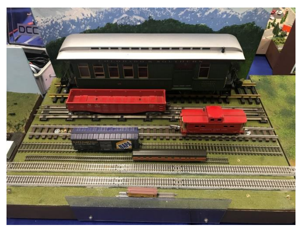
Nifty idea to show all the common gauges of model railroads on a module.