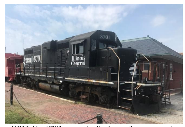
GP11 No. 8701 on static display at the museum in Carbondale, Illinois.