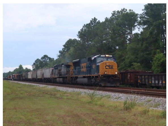
One of CSX's newest SD70MAC rebuilds thunders by Folkston, GA on a crisp summer evening.