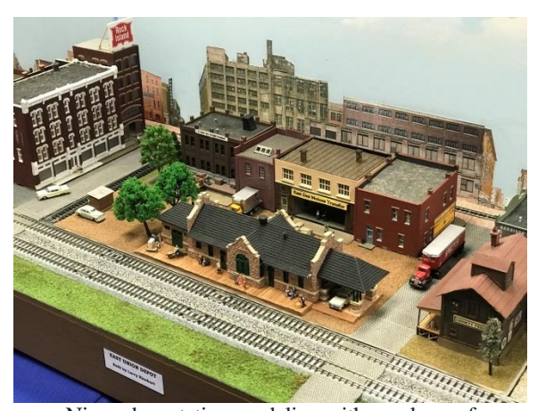
Nice urban station modeling with good use of background.