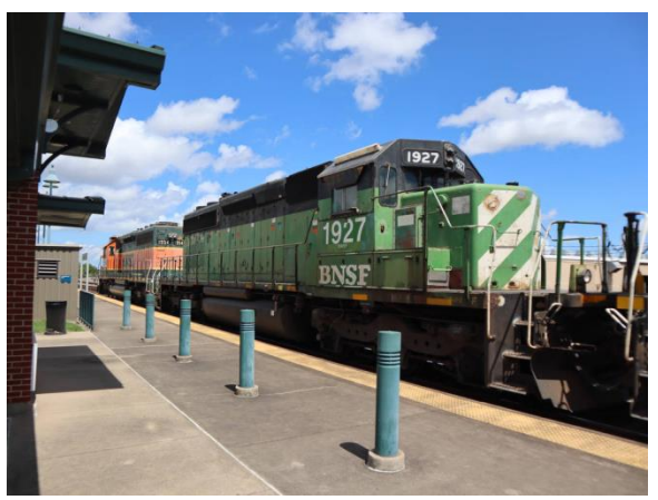
A former BN SD40-2 is sandwiched between two BNSF locomotives through Beaumont, TX.