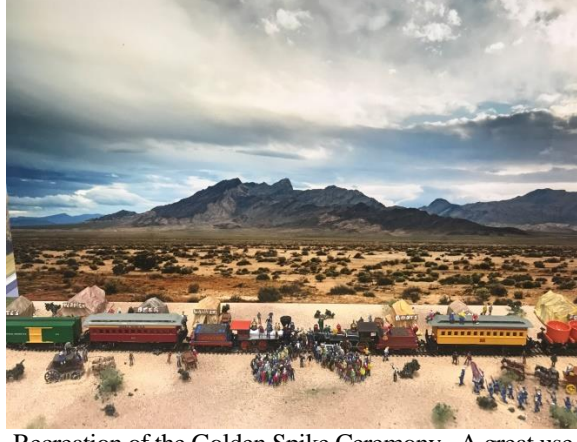
Recreation of the Golden Spike Ceremony. A great use of the background.