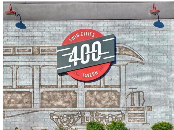
A nod to history. The Twin Cities 400 was a Chicago & Northwestern Railway passenger train between Chicago and Saint Paul, with a final stop in Minneapolis. The train took its name from the schedule of 400 miles between the cities in 400 minutes. This is a mural on the exterior wall of the Twin Cities 400 Tavern in Minneapolis, MN.