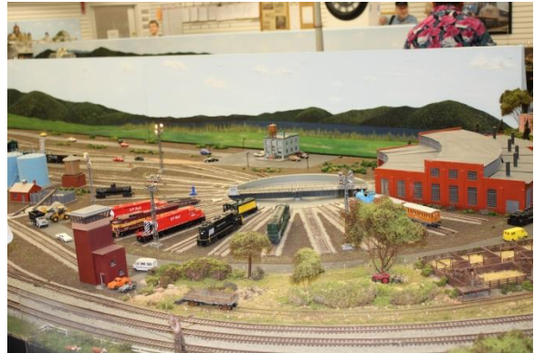
Detail of the roundhouse, turntable and engine facilities.