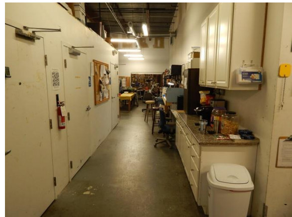
Snack and drink area, storage, and shop.