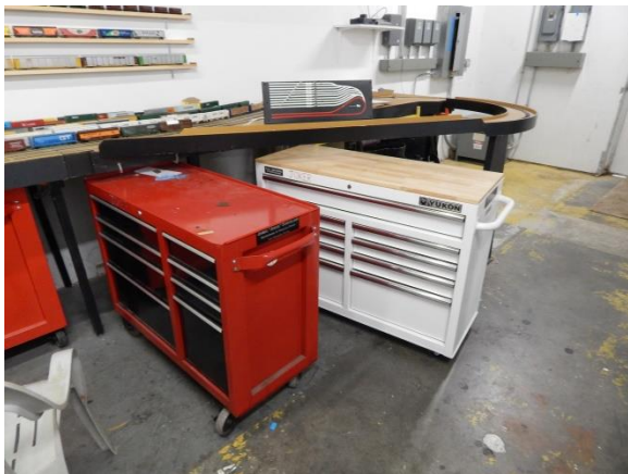
Individual member train storage under reversing loop in the train make up room.