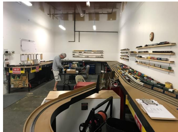
Make up yard in the back room – reversing loop in foreground – through the wall entry to layout at left.