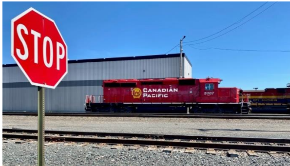
CPKC SD40-3 locomotive 5107 and a stop sign (for vehicles, not trains!) at Pigs Eye locomotive shop in St. Paul, MN.