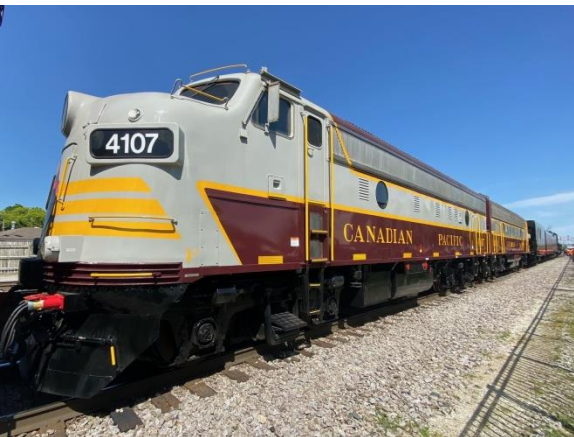
Canadian Pacific's F units provide backup power for the CPKC Final Spike Steam Special.