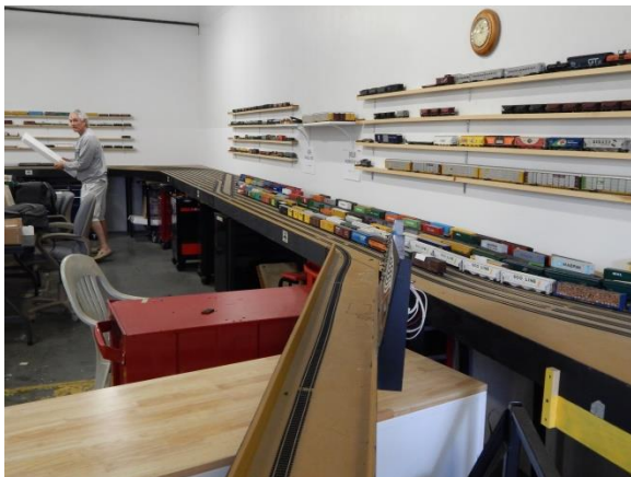
Train make up yard in the back room.