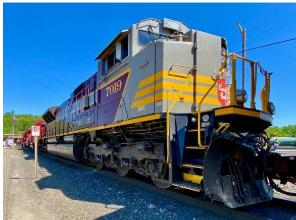
CPKC heritage EMD SD70 ACE locomotive 7019 at Pigs Eye Yard in St. Paul, MN.