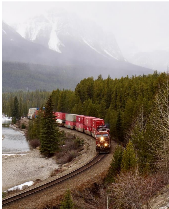
CPKC on Morant's curve by Lake Louise, Alberta. This is the famous curve where CP took publicity photos.