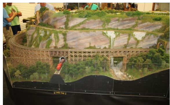
Intricate trestle work is abundant.