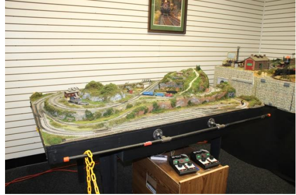
The N-scale layout.