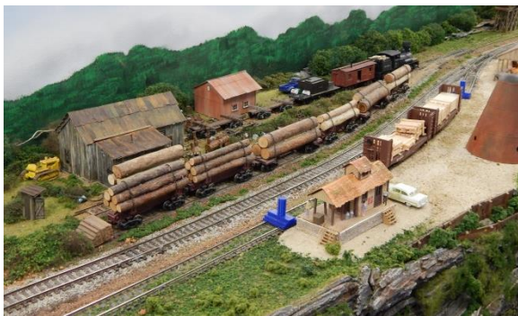
Logging camp ideas for our layout.