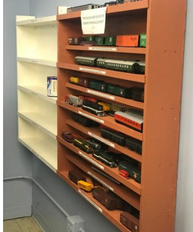
Member storage shelf space has been enlarged. Club engines that used to be on white shelves have been relocated to the staging track areas.