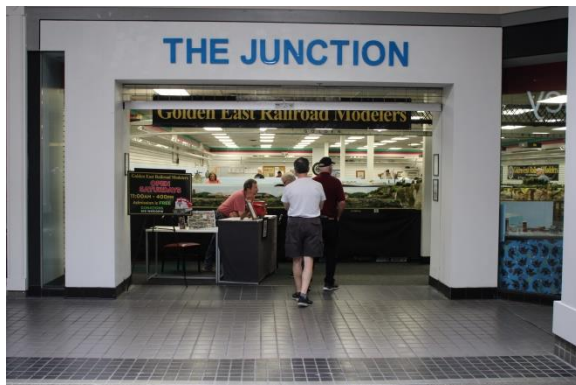
Mall entrance to the layouts.