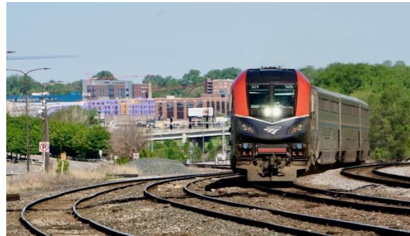
Amtrak’s Empire Builder departing St. Paul Union Station heading south along the Mississippi to Chicago. It’s being led by a new Siemens ALC-42 Charger.