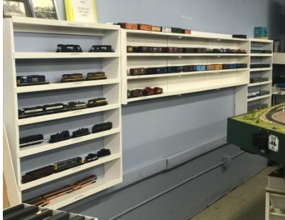
Newly installed and painted shelving for Club equipment in HO room. About half the Club locos are on the left hand shelf.