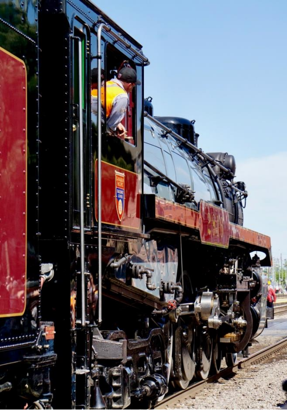
Canadian Pacific's Empress Class steam train on the CPKC Final Spike Steam Special. The train traveled from Calgary to Mexico City to celebrate the CP/KCS merger.