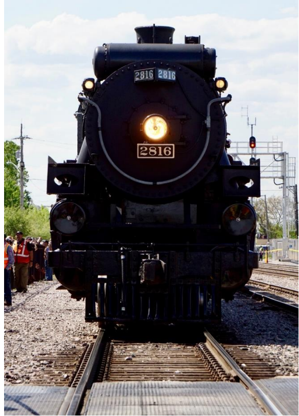
Number 2816 is a class H1b Hudson built by Montreal Locomotive Works. Taken in Franklin Park, IL.