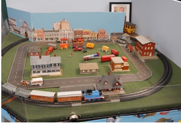
Thomas the Train layout for kiddie operation just inside the door.