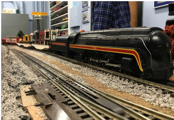
The circus train arrives in town.

Space restrictions prohibit displaying other parts of the larger collection items such as the large main tent and assorted supporting items. We have not been able to identify the original period that this collection dates from, so anyone with possible input please feel free to contact us.