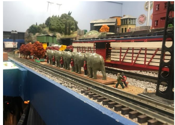
The parade of the elephants begins.