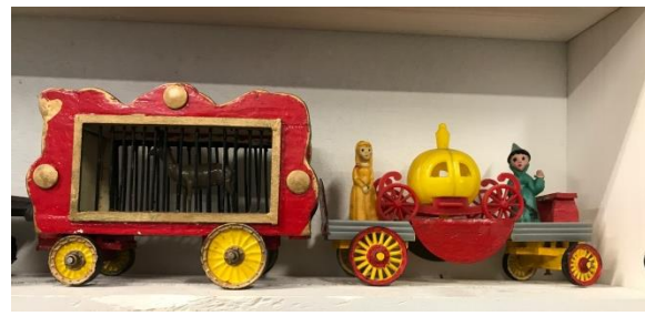
Animal cage and circus wagon.