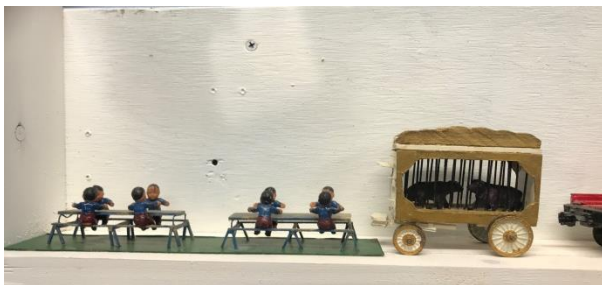
Circus train accessories.