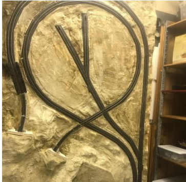
The orphan HO layout.