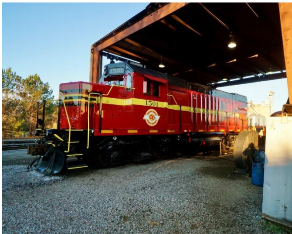
Carolina Coastal's new GP15r in NS Heritage Colors