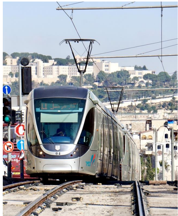
Jerusalem's Light Rail by the Old City in December 2023.