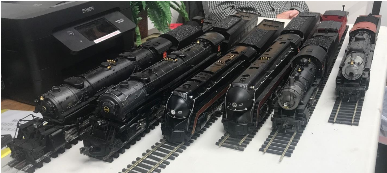
Locomotives shown from left to right: class Y-3, 2-8-8-2, Lionel; class A, 2-6-6-4, Lionel; class K-2, 4-8-2, Sunset/3rd Rail; class J, 4-8-4, Lionel; class M, 4-8-0, Sunset/3rd Rail; and USRA, Light 2-8-2, Sunset.