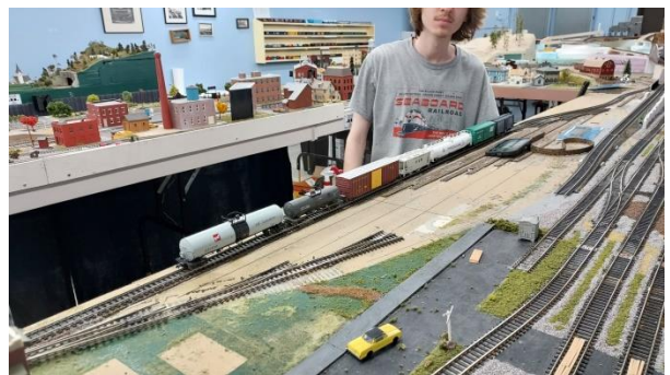
First train over the realigned Main 4 on Module 9 of the legacy layout.