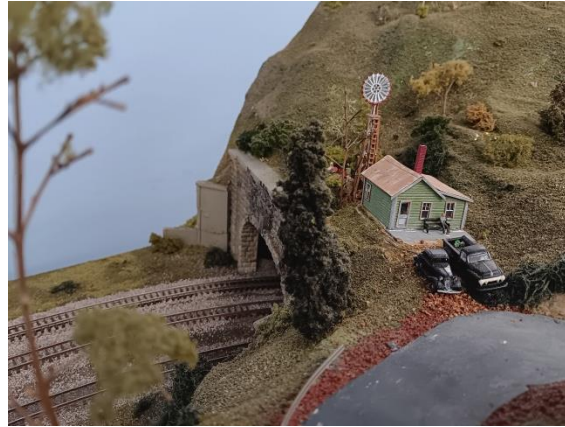
Moonshiners are also busy on the layout – they just erected a shack above the tunnel portal.