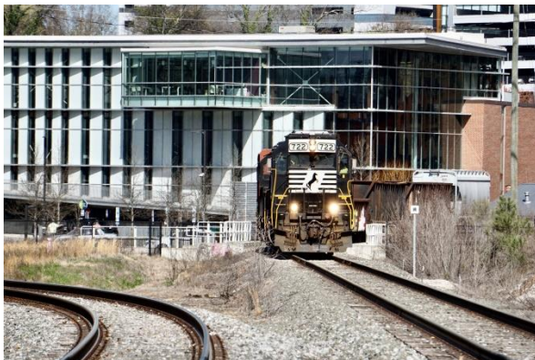
Norfolk Southern number 722 (EMD RP-E4C) leading a local outside Raleigh Union Station.