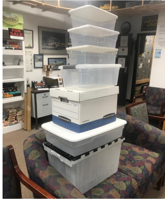
Look what came back empty.