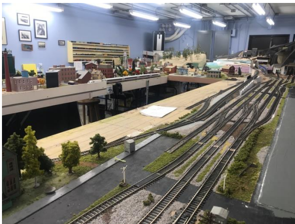
A section of Module 9 has been cleared to accommodate a new yard that will improve operational capabilities.

Plans are in preparation for extending the interior staging yard toward the Crew Lounge to improve its functionality. The existing yard will be extended behind Module 4 and a direct connection to allow trains onto Main 4 will be constructed. The improvements will allow for make-up of longer trains with direct access to the mains on the legacy layout, removing the current bottleneck from Main 4 on Module 3.