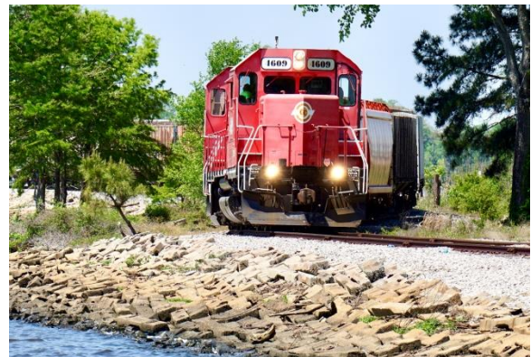
Coastal Carolina number 4609 (EMD GP9Rm) in red, white, and blue livery (NS Heritage Colors) along the shoreline in Washington, NC.