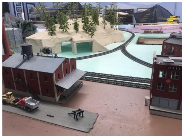
Earth colored paints are covering the blue foam on the extension. Watch as coverage expands – scenery won't be far behind the paint.