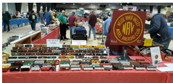
Club sales table featuring HO rolling stock.