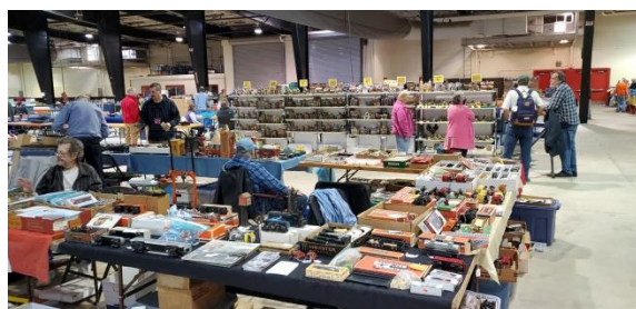
Lots of vendors.