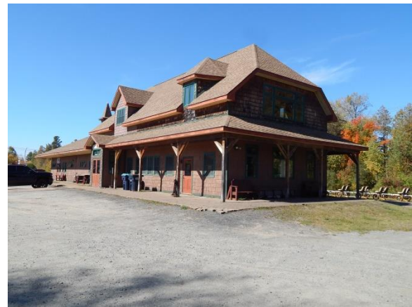
The current station in Tupper Lake, NY is now at the terminus of the Adirondack Railroad. It was recently reconstructed based on the original 1895 structure.