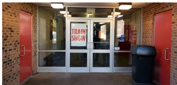
Welcome to the Graham Building.

Sorry, but only a few of you wound up in the pictures that we have room to print for this initial report. Additional pictures can be submitted to klhowardjr@aol.com for inclusion in the December Whistle Post. The first group of photos is courtesy of Ted Kunstling .