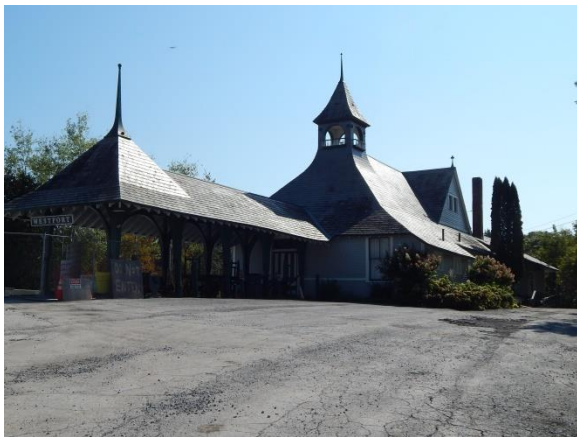
The Delaware & Hudson station at Westport, NY was completed in 1876. It is being restored and hosts Amtrak service to New York City and Montreal.