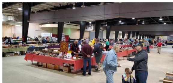
Setting up the Club sales table.