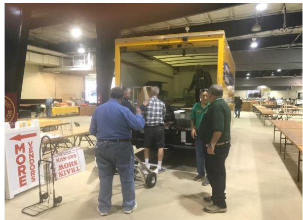
Loading out the truck for the trip back to the Clubhouse on Sunday afternoon.