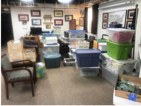
The Crew Lounge was filled with boxes after the show. A Board of Governors' meeting was held the following evening after the space was cleared.