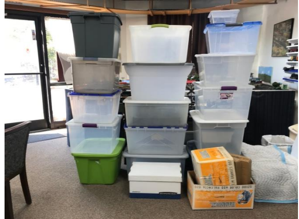
One measure of our success - all 17 of these containers went to the show full and returned empty.