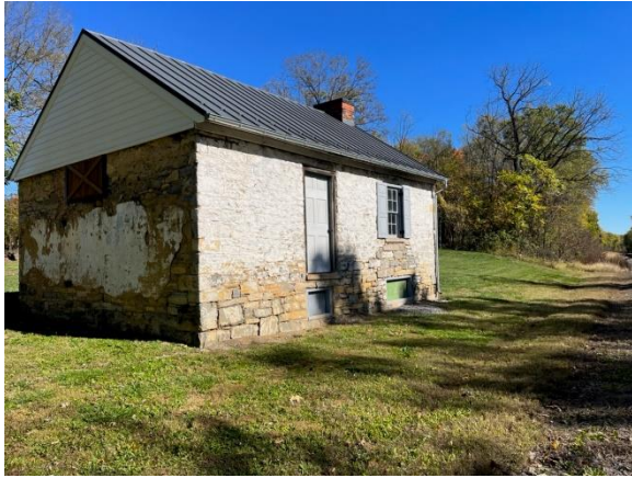
This is the oldest surviving combination passenger/freight station in the US, located at Duffield, WV on the old B&O main (now CSX).