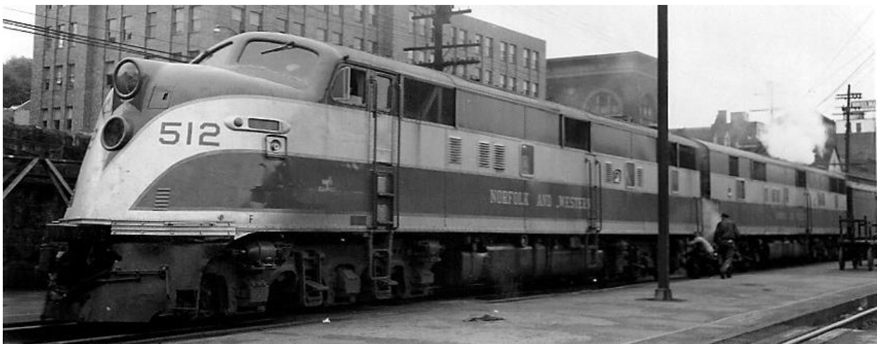
ACL E6A 512 and one of the E7B units lettered for the N&W.

The Norfolk & Western Railway (N&W) ended passenger steam operations in the summer of 1958. When this occurred, the N&W had not yet received sufficient numbers of steam generator equipped EMD GP9's to power its passenger trains. As a result, the N&W leased one EMD E6A, four E7A's, and three E7B's from the Atlantic Coast Line (ACL). What is not commonly known by many railfans is that N&W lettered the leased E units with standard N&W lettering but kept the purple and silver colors of the ACL. It must have been a colorful sight to see purple and silver diesels pulling Tuscan red and black passenger cars. The E units also ferried Southern Railway's Birmingham Special , Pelican , and Tennessean between Bristol and Monroe, Virginia on N&W trackage. It would have been interesting to see ACL purple and silver diesels pulling Southern passenger cars. Anybody want to model these E units?