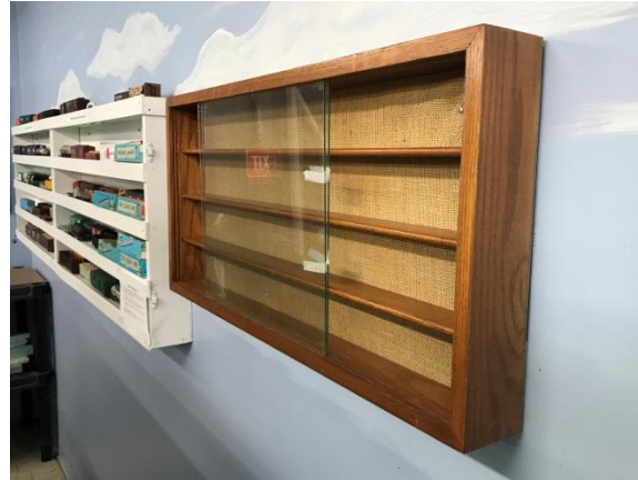
New cabinet in the HO layout room will be used to house the best of the Club locomotives.