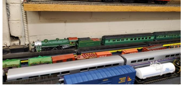
Staging tracks are in the shop next to the layout. Permission is required to bring a train onto the layout.