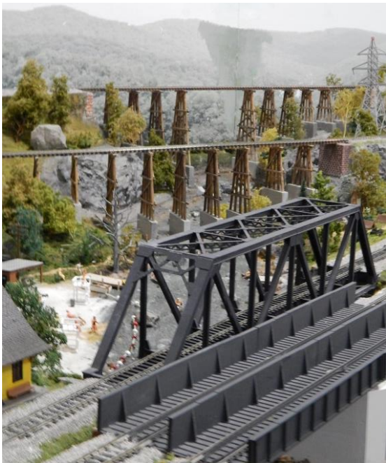
Nice bridgework and river scene (Photo by Ken Howard).