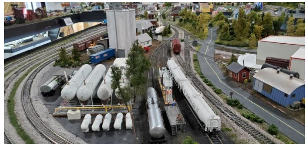
Industrial scene on the Sandhills layout.