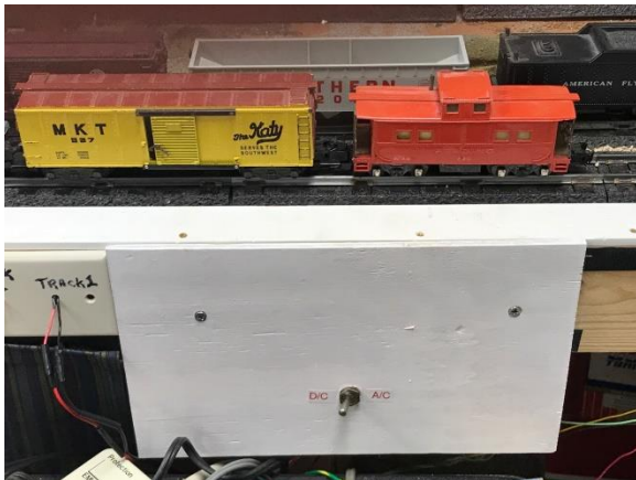
The S scale should be easier of novices to operate now that a switch of AC or DC operation has been added.