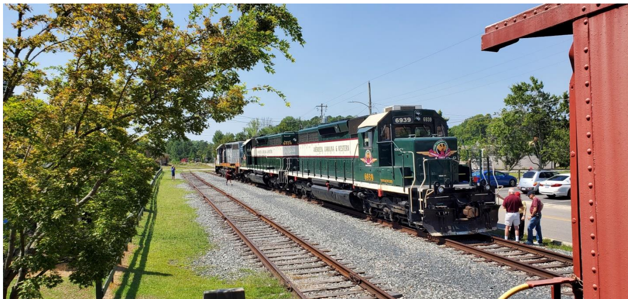
Aberdeen, Carolina & Western SD-40s numbers 6939, 6026, and 6922 were parked outside the Aberdeen museum. The units were manufactured in Canada by GMD and acquired from Canadian National.

Not only did we visit museums and model railroads on our Aberdeen/Hamlet outing, but we also got to see and photograph real equipment that's still in service.