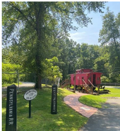
Bobber caboose LGV #57