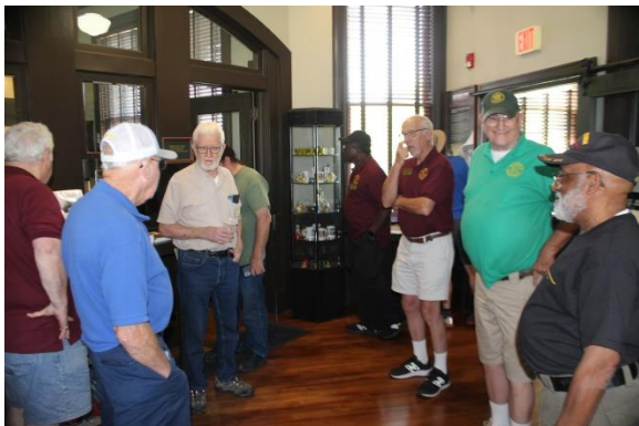
A crowd gathers in the museum.