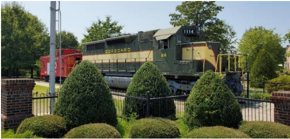
Seaboard diesel 1114 on static display adjacent to the Tornado Building (photo by Ted Kunstling).