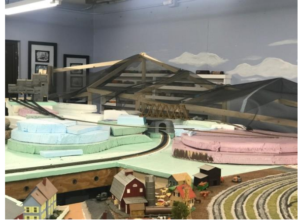
Mount Witwer is taking shape. Note the coal facility on the left.