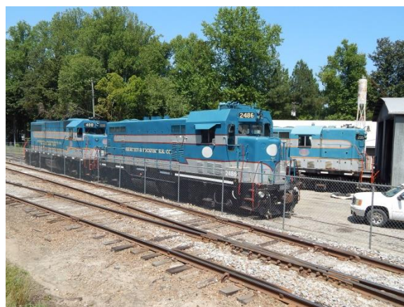
Aberdeen & Rockfish locomotives 2486, 400, and 205 at the Aberdeen shop (Photo by Ken Howard).