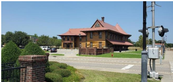
The relocated and restored Seaboard Airline Depot (Photo by Ted Hunstling).