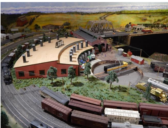
The O scale layout in the Tornado Building.