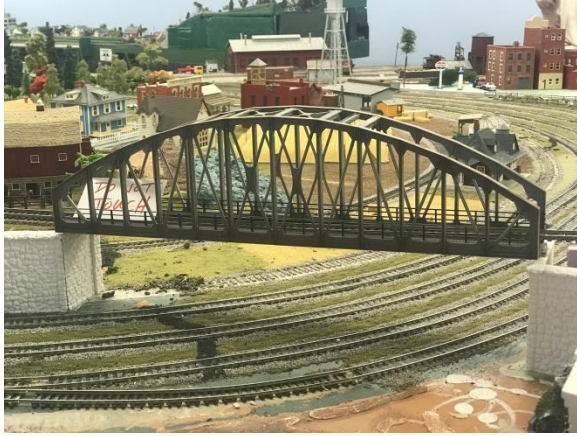
No longer a bridge to nowhere.

Stop by the Club and enjoy the construction and scenery additions to the HO layout. Both the extension and the legacy layout are receiving the attention and upgrades from a lot of members.