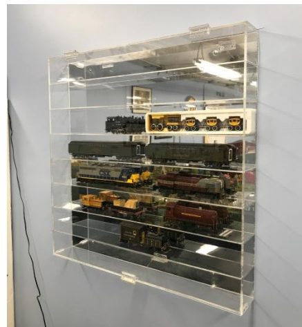
New display cabinet for possible Club acquisitions or sales.

Two new wall-mounted cabinets have been added in the HO layout room. The clear case near the entry door will house high quality models that are for display purposes only. The wooden cabinet with sliding glass doors on the wall behind Mount Witwer will be used to house the Club's more fragile engines (e.g. the Nickel Plate Berkshire). Use of these locomotives will be limited to Senior members. Watch for exciting additions to these cases in the coming weeks. Some very high quality models will be emerging from house arrest in Board Members' lockers.