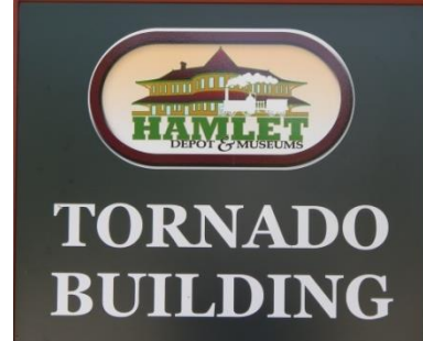
The building that houses the Tornado and an O scale layout.