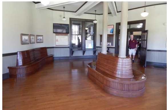
The waiting room for Amtrak trains in the restored station (photo by Ken Howard).