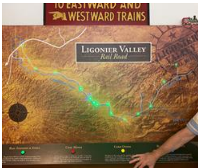
Interactive map of LVRR