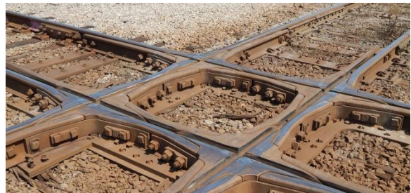
The crossing is still there, but is now single track only