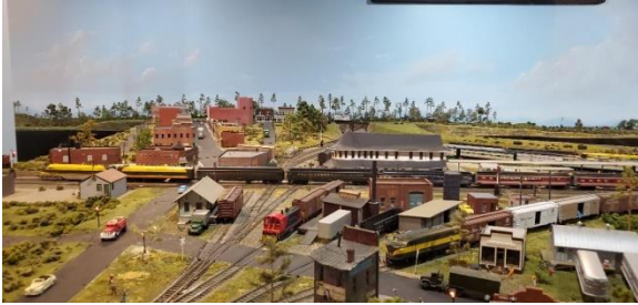
The HO model of Hamlet in the basement of the depot and museum.