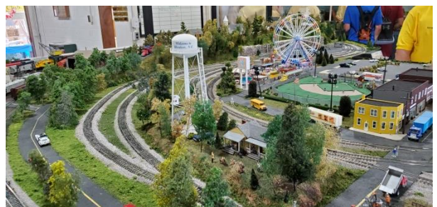
Downtown Aberdeen is an important part of the model railroad.