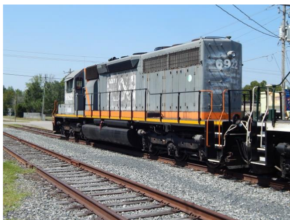
Aberdeen Carolina & Western SD-40 6922 still in somewhat faded CN livery.