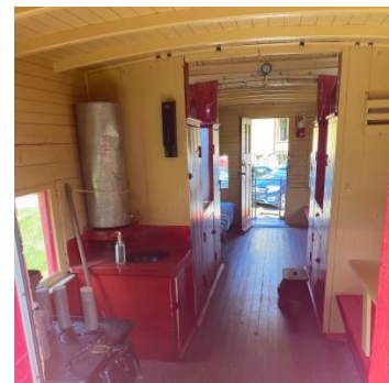
Restored caboose interior