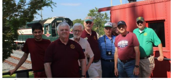
Some of the cats got herded together,