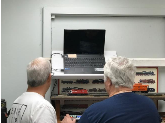
The test track in the shop has received a new upgrade with the installation of a laptop with JMRI.

A new layer of foam flooring has been added in the shop. You'll notice that the floor in front of the test track is now a lot easier on the knees and feet. The test track has been equipped with a JMRI computer to upgrade our capabilities. Thanks to Ralph James for the installation.