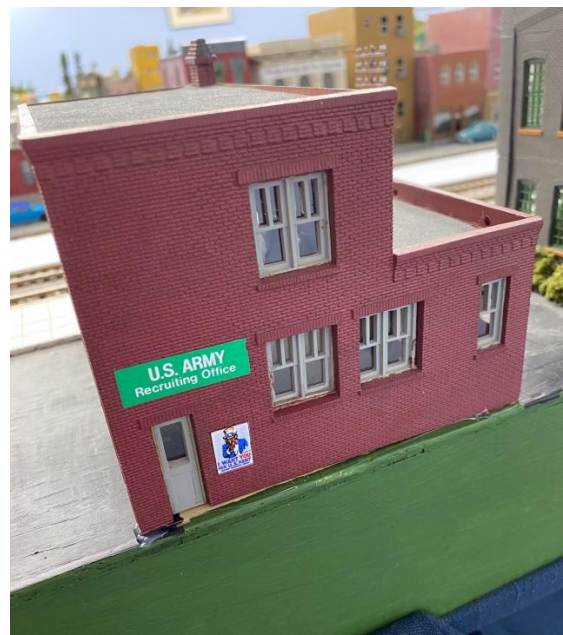
Join the Army and see the world at our new recruiting office.