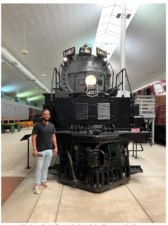
Union Pacific 4-8-8-4 Big Boy #4017