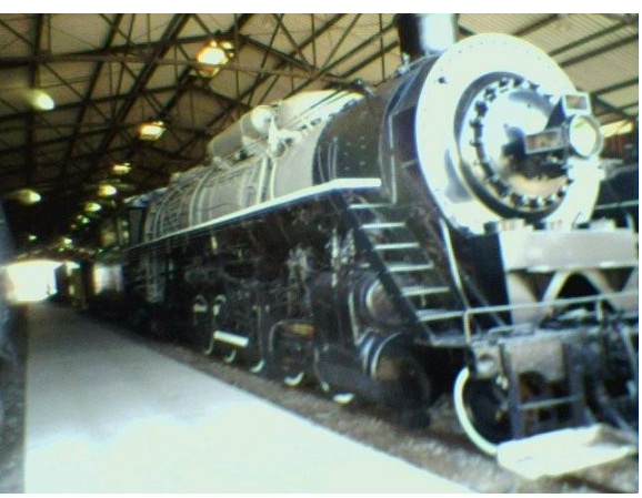
DM&IR 2-10-2 Santa Fe #506