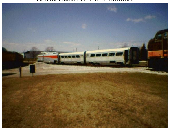
Rock Island #2 GM Aerotrain.