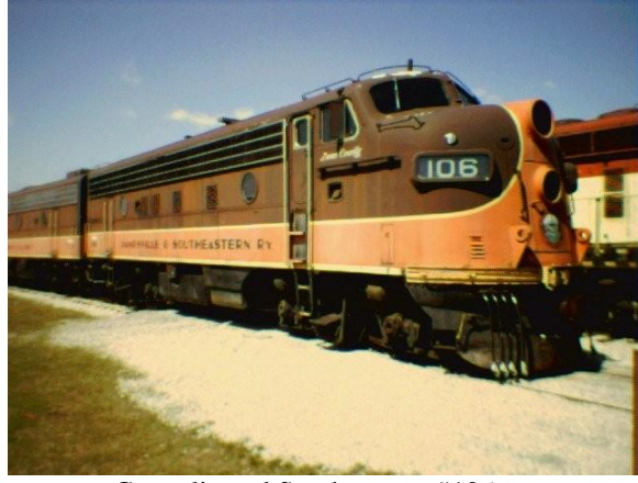
Centralia and Southeastern #106