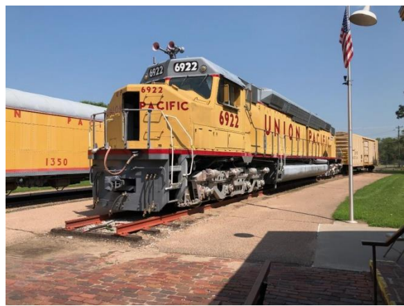
Union Pacific EMD DDA40X number 6922