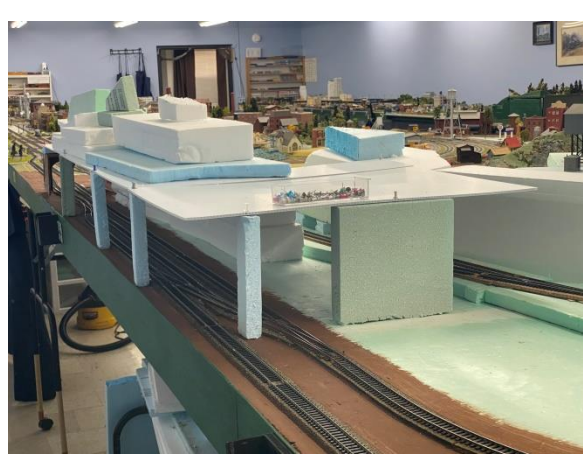
Access to the make up tracks beneath the growing mountain.