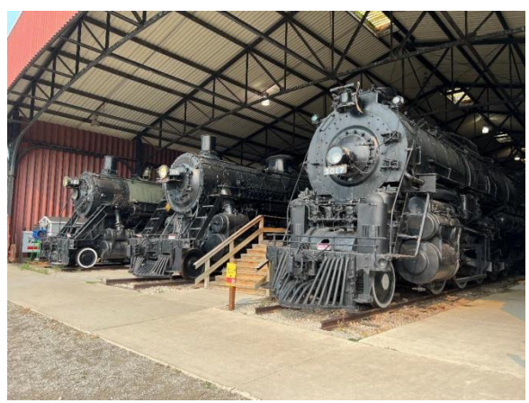
Left to right: Lake Superior & Ishpeming 2-8-0 #24; Soo Line 4-6-2 Pacific #2718; and AT&SF 2-10-4 Texas #5017.