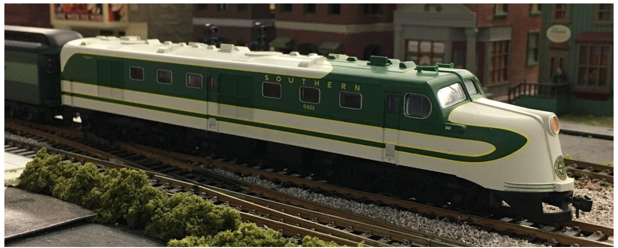
HO model of the Southern (CNO&TP) 6401 on the NRV Club layout (Photo by Tom Garren).