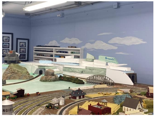
The formerly chaotic pile of foam on the extension is taking shape.

Stop by the Club and enjoy the construction and scenery additions to the HO layout. Both the extension and the legacy layout are receiving the attention of a lot of members.