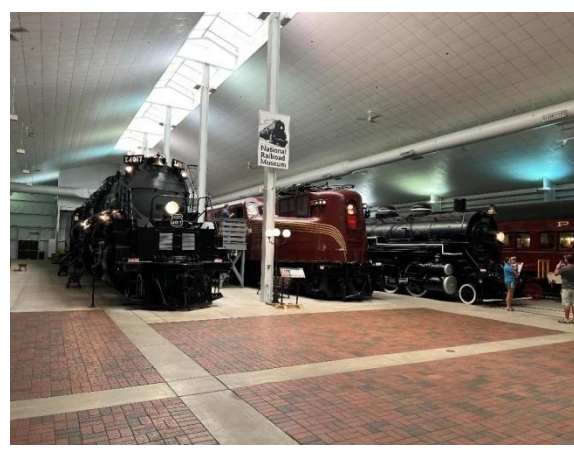
UP Big Boy #4017, PRR GG1 #4890, and United States Army 2-8-0 consolidation #101 Pershing