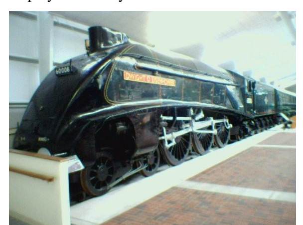
"Dwight D. Eisenhower" British Railways Board LNER Class A4 4-6-2 #60008.