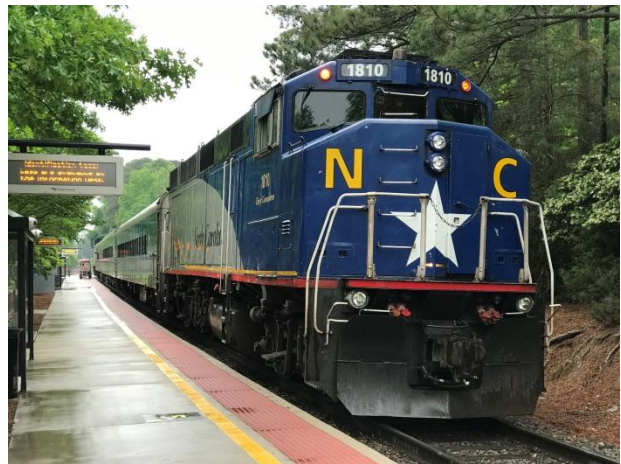
The Piedmont departing Cary with No. 1810 the City of Greensboro bringing up the rear.