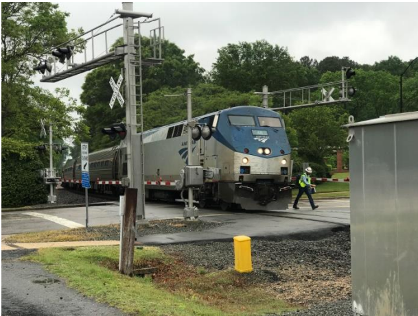
The northbound Carolinian departing for Raleigh behind GE P42DC No. 48.

Sometimes you get lucky in catching a lot of railroad action in a short time. Ken Howard took the following pictures at the Cary Amtrak station over a time span of only 21 minutes. Who knew Cary could be a train watcher's hotspot?