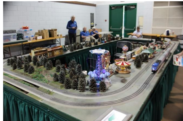
East Carolina O gauge layout.

By the way, the Board of Governors also opened the books for the upcoming Fall show and scheduled the next Open House. No time to rest on your laurels, folks!