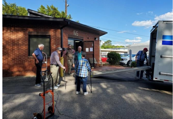
Loading out the Penske rental truck on Thursday evening