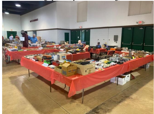
Club sale table with LEGO and N-scale layouts