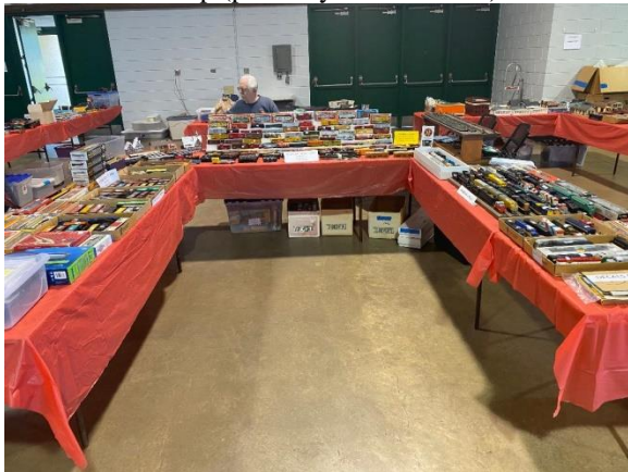
Friday night at the Club tablee