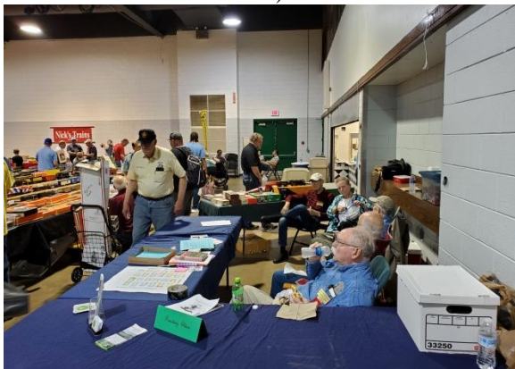
The “Presiding Elders” table