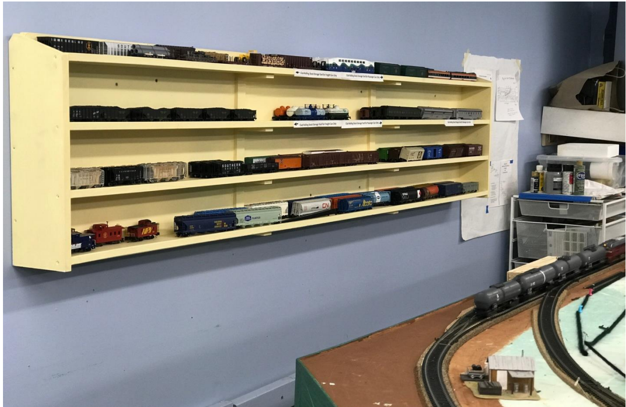
Club car storage shelves relocated to the train set-up area in the HO layout room on May 31 st .

Construction has also begun on the Main #4 extension. Buildings and switches and the crossover between mains three and four near the legacy engine house have been removed. Next step is to cut in the switch and establish the grade to take the extension onto the new layout.