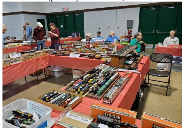
A quiet moment at the Club sale table