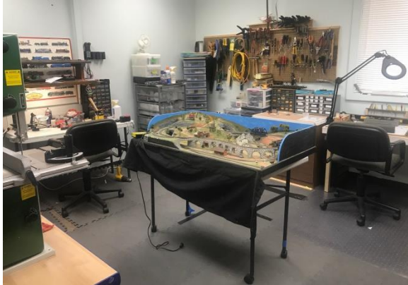
Pre-show preparation of the Raffle Layout in the Club shop

It is now official – the Board of Governors closed the books on the “Spring into Trains” show at the meeting on June 5 th . If you haven’t heard, the show was a roaring success and an important source of revenue for the Club. Here are additional photos that should revive some good memories for those who attended and helped make the entire effort worthwhile.