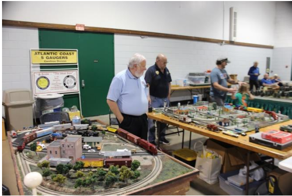
Atlantic Coast S Gaugers layout