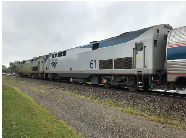
The northbound Silver Star running an hour and 40 minutes late departs Cary behind 119 and 61, a pair of GE P42DCs.