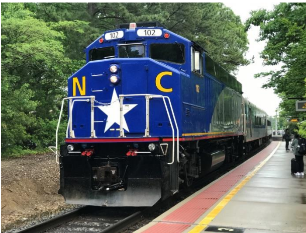
The southbound Piedmont arriving in Cary lead by EMD F59PH No. 102.