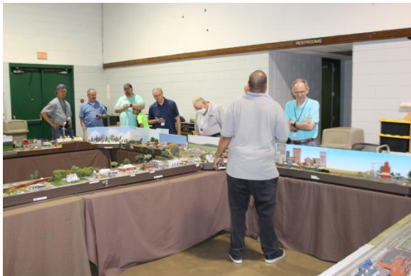
North Raleigh N Scale layout