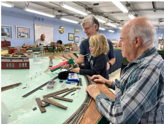
The youngest Club member gluing down roadbed on Main Extension #2.

Construction related to Main Line Extension #2 continues. A preliminary layout of industrial sidings has been completed for the new town, an agricultural area, and the engine servicing facility. Installation of switches and track will commence shortly. As shakedown operations continue, minor glitches in the track have become apparent and will be corrected. The photos below show construction progress for those who haven't been to the Clubhouse lately.