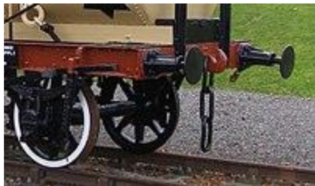
Three link chain.