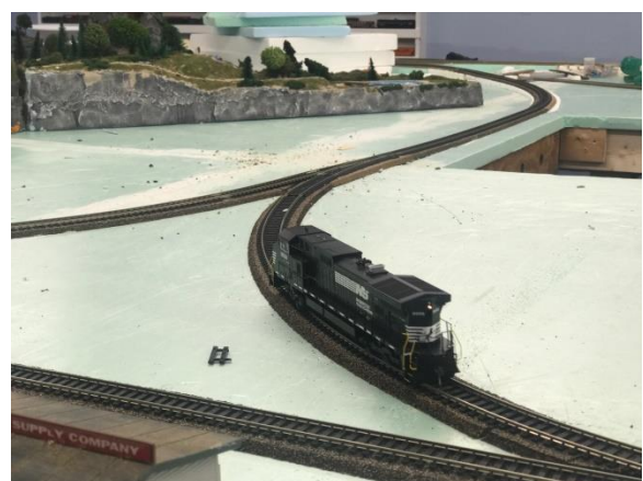
The first locomotive to negotiate the wye on March 4 th .