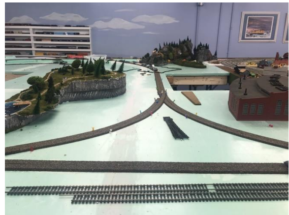
The first cork roadbed layout of the wye on Main Extension #2.