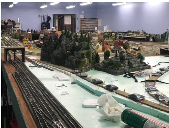
Construction of Main Extension #2 in progress. Bags of shot help assure a good glue job for the cork roadbed.