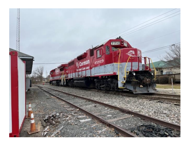
Editor's Note: 7710 is an EMD GP38 originally built for Penn Central and 8572 is a GE B39-8 originally built for LMX. Corman has acquired former Norfolk Southern trackage from Fuquary to Fayetteville and is operating as Raleigh & Fayetteville Railroad.