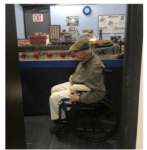
A visitor enjoying the O-scale layout.