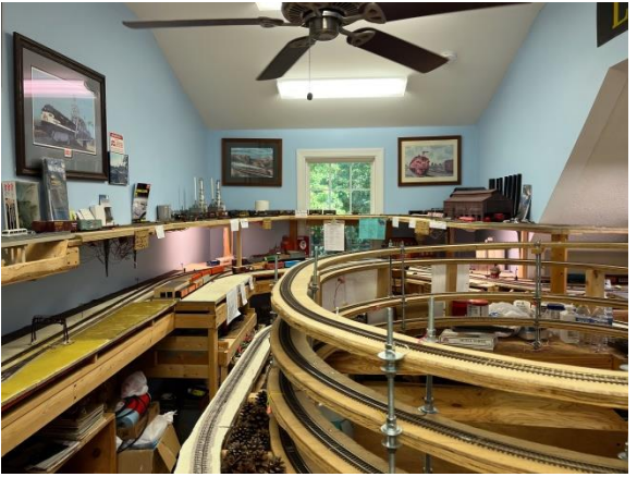
The helix connecting the layout levels looking from Gilmore back toward the US Steel plant.