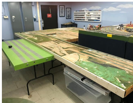
July 17 th - The first assembly of the new layout expansion modules is completed in the HO layout room.

Ralph James has also completed his assessment of the wiring on the existing layout and will need help to complete the repairs and wiring upgrades. He is also preparing the wiring plan for the expansion to include the wyes and reversing loops in the track plan. The expansion track plan will also be revised to reflect connections to the existing mains that will be consistent with our operational goals and objectives. As always, plans change over the course of a project to reflect