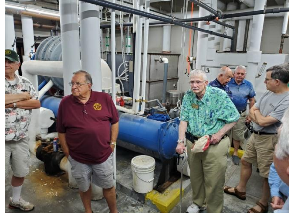
The basement electrical and cooling plants that support the machines upstairs.