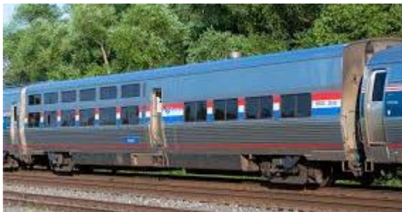
Amtrak Viewliner Dining Car

What was really exciting was immediately behind the locomotives: a Federal Railroad Administration, Office of Safety, #DOTX221 passenger car, all dressed up in the Pennsylvania Railroad Heritage scheme, complete with the buff stripes and lettering. #DOTX221 appears to have started life as a Pullman or ACF 10-6 sleeper base on the window pattern.