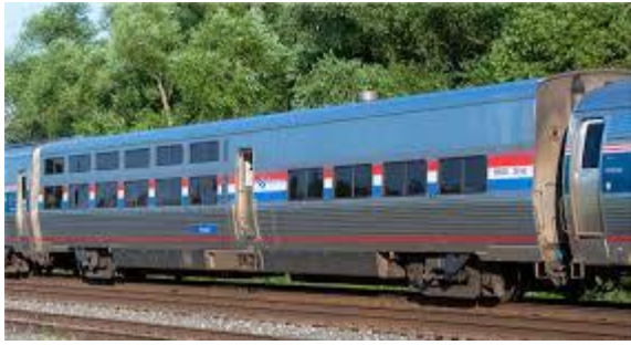
Amtrak Viewliner Sleeping Car