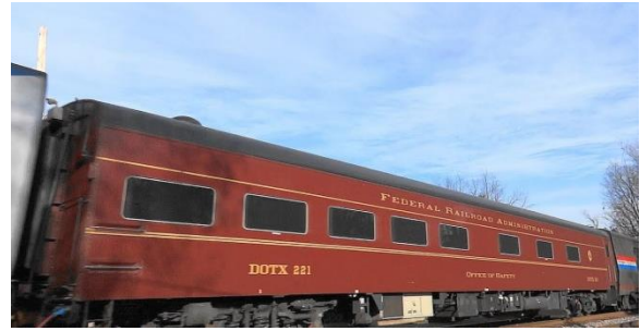
FRA Administration DOTX 221