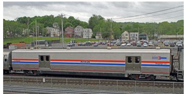
Amtrak Viewliner Baggage Car