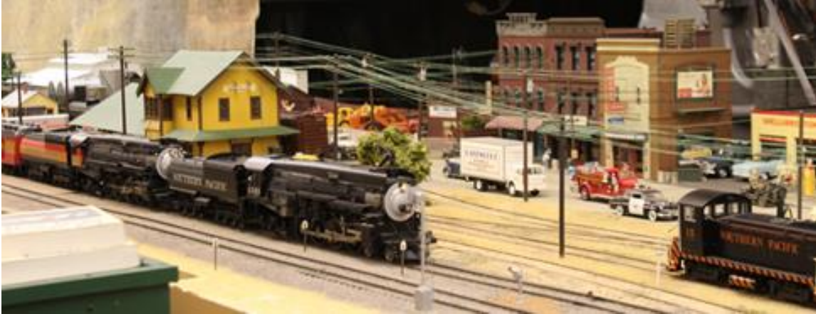
Double-heading through Bealville.