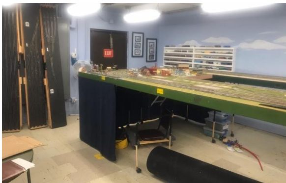
The layout prepped for removal of modules 1 and 10.