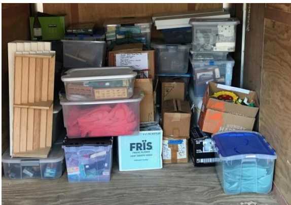
Partially loaded trailer