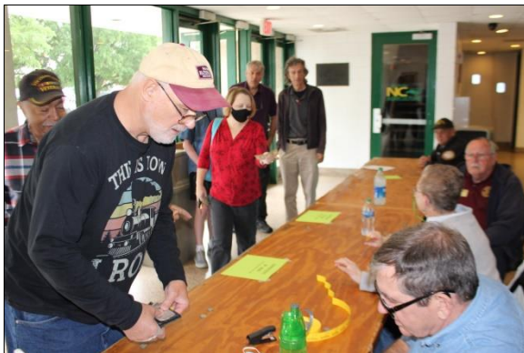
The welcoming committee. (Randy Foulke)