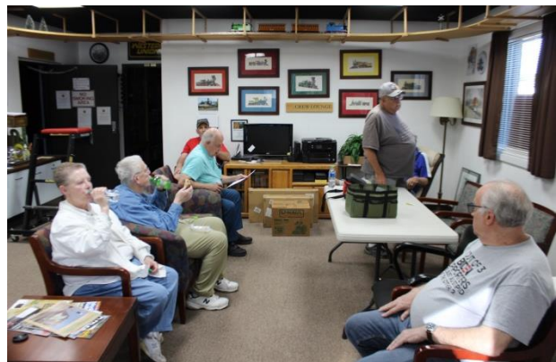
Relaxing in the Crew Lounge after the loadout.