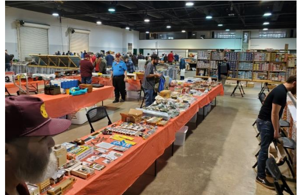
The NRV Club sales table. (Ted Kuntsling)