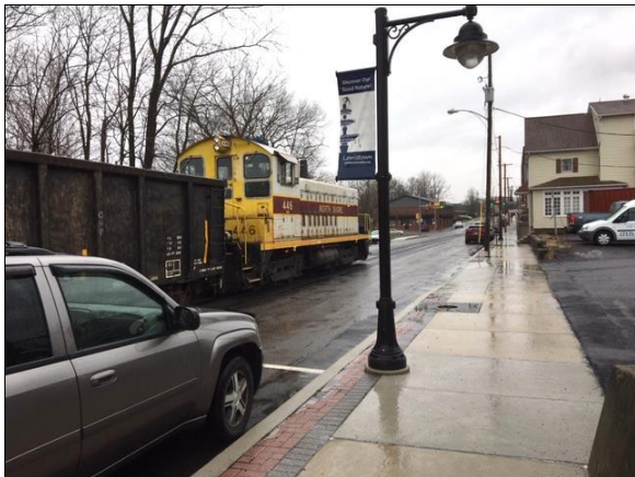
EMD SW9 no. 443 street running in Lewiston.