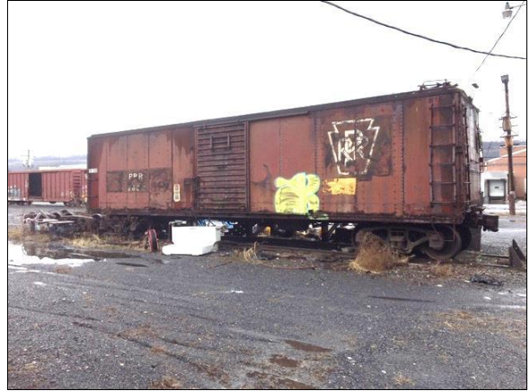
PRR X-29 boxcar.