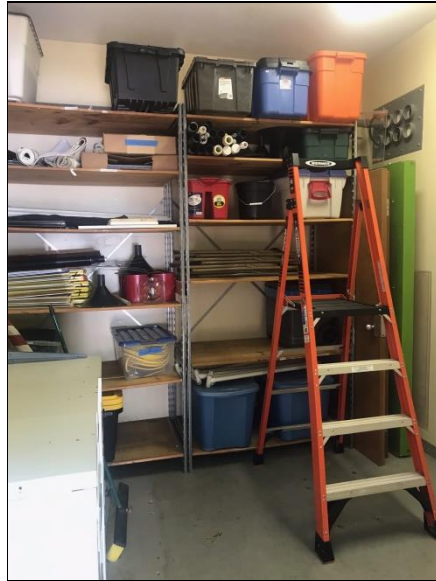
The Club storage room for storage of show materials and general use items.