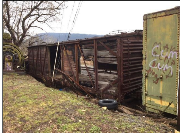
Single sheathed boxcar at the Kovolcheck scrapyard.