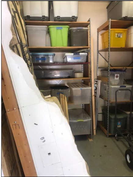
Storage room for layout construction materials and show sales.

A well-attended work session was held Wednesday, May 4 th to finish the job of cleaning out the Club storage closets and disposing of unwanted and unneeded items that were cluttering the rooms. The successful cleanout has opened space to store modules for the HO layout expansion and the layouts designated for sale or raffle at future shows. One pickup load went to the dump and a second went to charity.