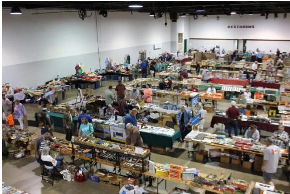
Overview of the show floor. (Randy Foulke)