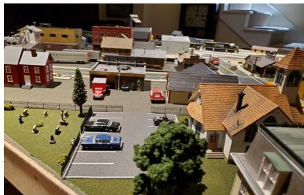
Cemetery behind Hadnot Methodist Church