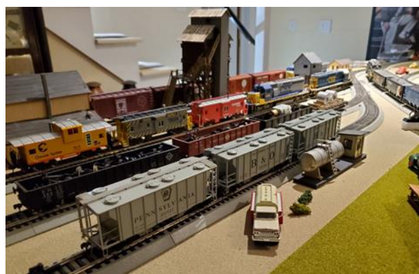
Staging yard and locomotive service area

Ballast, grade crossings, appropriately tall tree sizes, barbed wire fence have now been added. The wooded area provides a visual break between the rural highway and the heavy industrial zones. Ballast has been added along the E-Z Track, and the highway elevation gradually rises to the level of the E-Z Track grade crossings. “Ground goop” composed of Celluclay, vermiculite, “mudslide” colored latex paint, white glue, and a dash of Lysol make an excellent and versatile ground cover. Static grass and shrubbery are yet to be added. Ted’s shop is shown below.