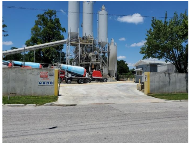
A visit to the plant on West Street near NS Glenwood Yard in Raleigh offered guidance and inspiration.

When: I try to achieve a 1950's ambience with my scenery, evoking small North Carolina towns, but run whatever equipment pleases me, sometimes even a Hornby Flying Scotsman, a favorite of my grandson. After all, modern trains pass old structures.