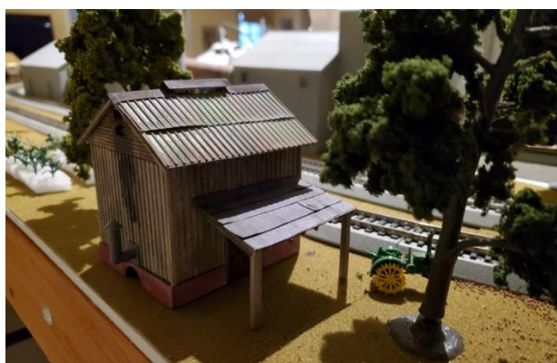
Tobacco barn with tobacco plants waiting to be put out