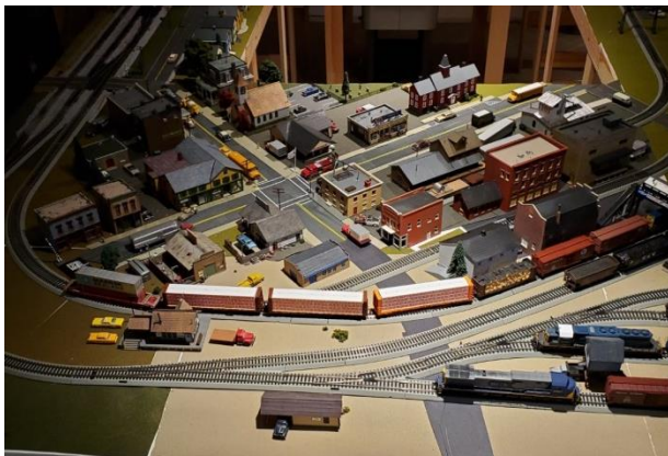
The Town of Hadnot has a church, school, police station, gas stations, grocery store, theater, offices, businesses, light industry, café, and even a food truck.

Since my locomotives are from several railroads including Norfolk Southern, CSX, and other mid-Atlantic lines, I decided to name my layout the "Rock Creek Division" after the creek behind my house rather than call it by a specific company. I also use local names that are evocative for me, such as Nahunta and Pisgah in addition to Hadnot. I am partial to rolling stock and loads frequently seen locally: covered hoppers, coal, wood chip, tank, lumber, and container.