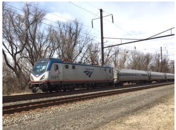
AMTRAK Bombardier/Alstom HHP-8 #659 on former PRR main.