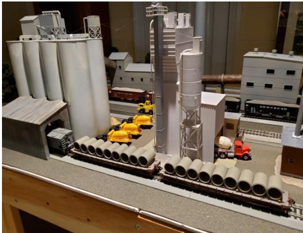
The cement plant is composed of two Walther's kits.