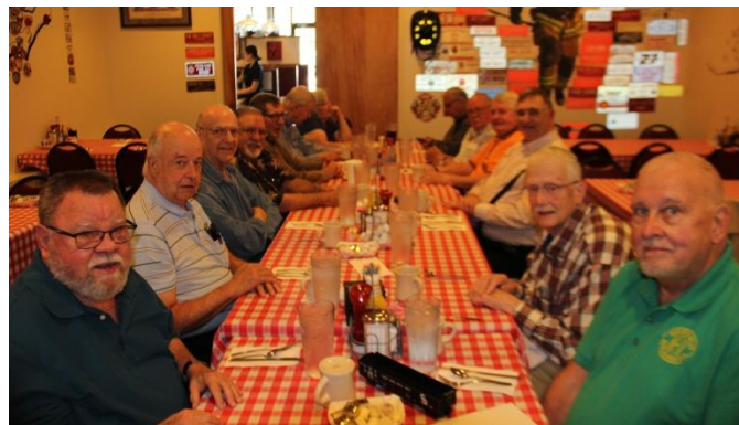
NRVMRC breakfast at Barry's Café on 4/6/22

Breakfast Social: Every Wednesday, 9:00 am at Barry's Café, Raleigh, NC.