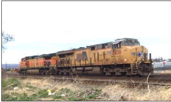
UP SD9043MAC # 8038 on PRR near Harrisburg, PA.