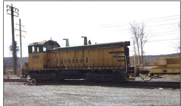
Steelton & Highspire railroad SW1200 switcher #1280 at rail recycling mill in Steelton, PA.