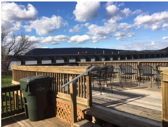
NS 911 crossing former Pennsylvania Rockville Bridge from BnB deck.