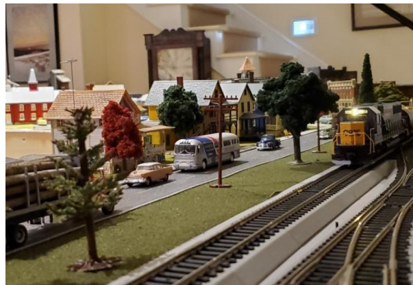
Rural highway zone before adding ballast and grade crossing