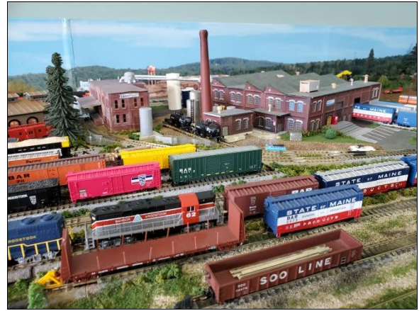
Lots of State of Maine loads of potatoes.