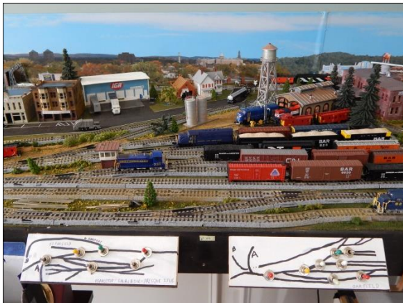
Control panels for the central portion of the layout.