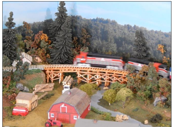
Hand built curving trestle.