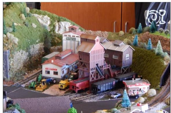
Close up of an industrial area on the layout.