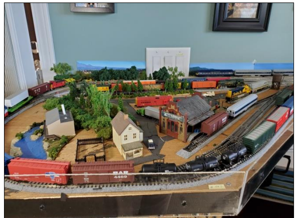
Typical Maine town with loop.