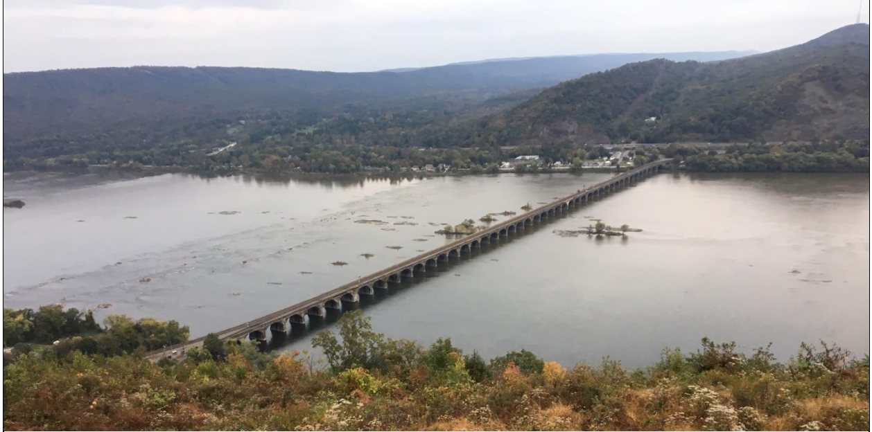
View of the Rockville Bridge across the Susquehanna River from Marysville, PA.