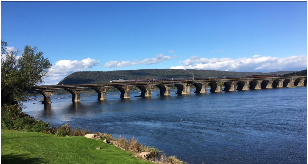
The Pennsylvania crosses the Rockville Bridge on a beautiful afternoon. Shot from the deck of the Bridgeview Bed and Breakfast.