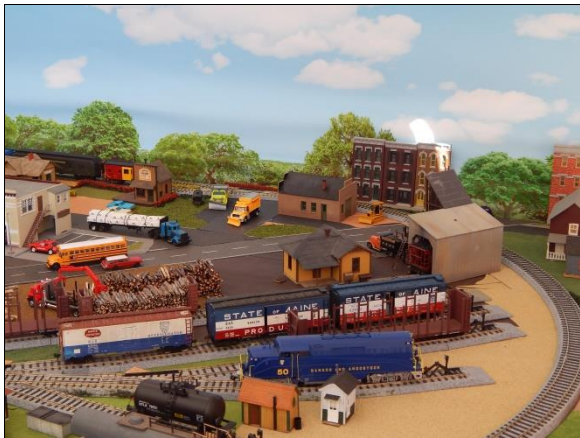
Potato shipping facility.