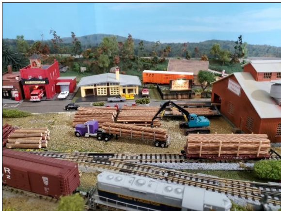
Lumber products are a big industry in Maine.