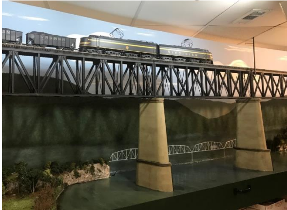
Virginian crossing of the New River.