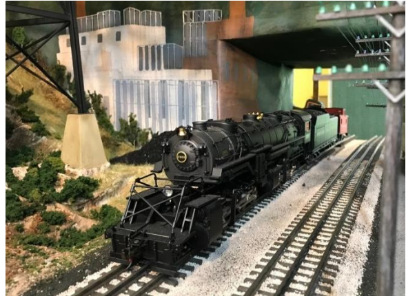
The yet to be completed lower level of the N&W.