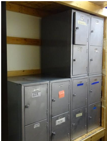
Relocated lockers in storeroom.

For those who weren't able to attend, the HO layout room and storeroom next to the shop have a new look. The old lockers are now in the storeroom, the tall storage cabinet is in the men's room, the shelving from the men's room is now on the north wall of the HO layout room, and a new set of shelves, donated by Mike Keelean, has been mounted on the west wall of the HO layout room.