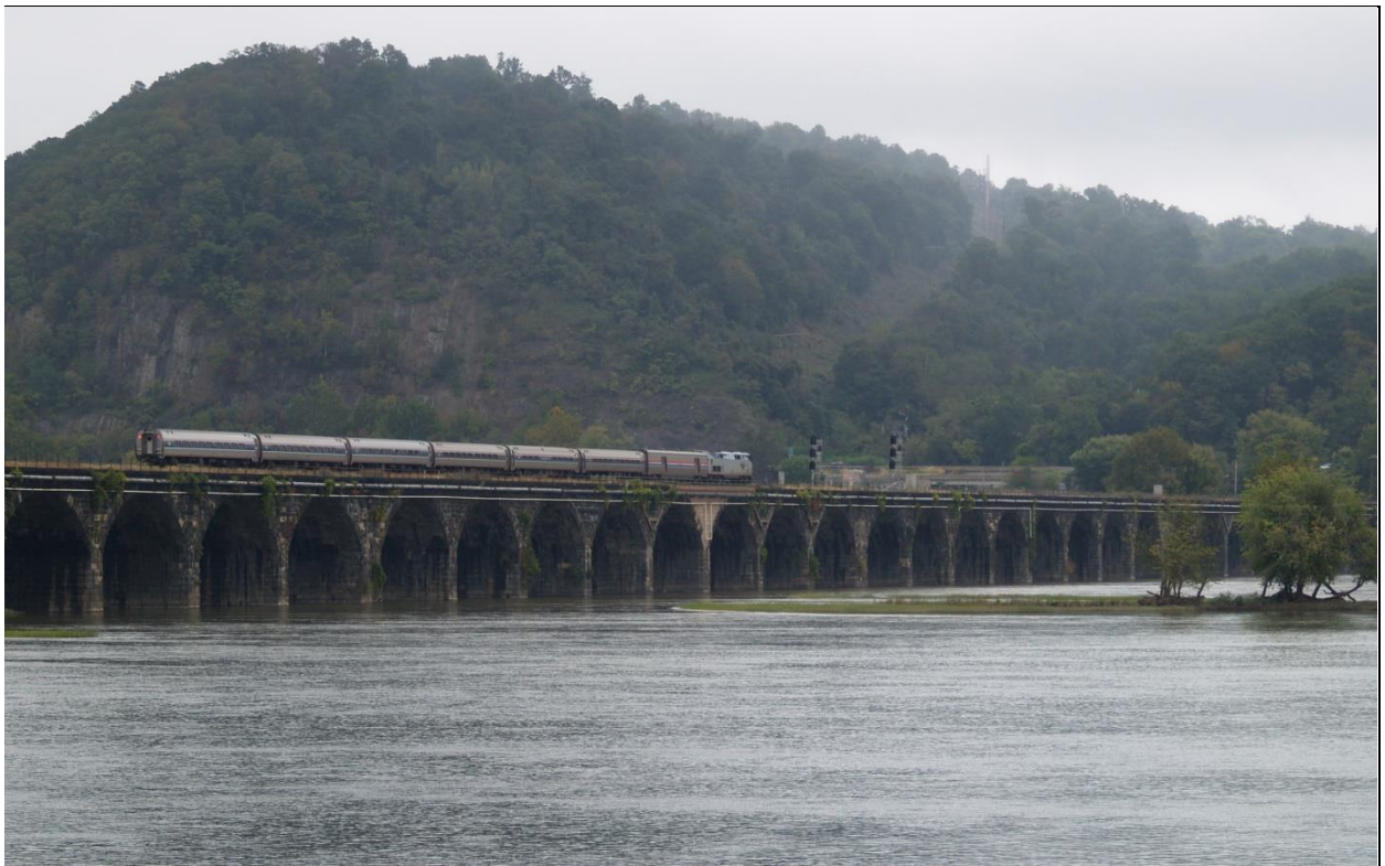
For those who would rather see passenger rail, here's Amtrak crossing the viaduct.