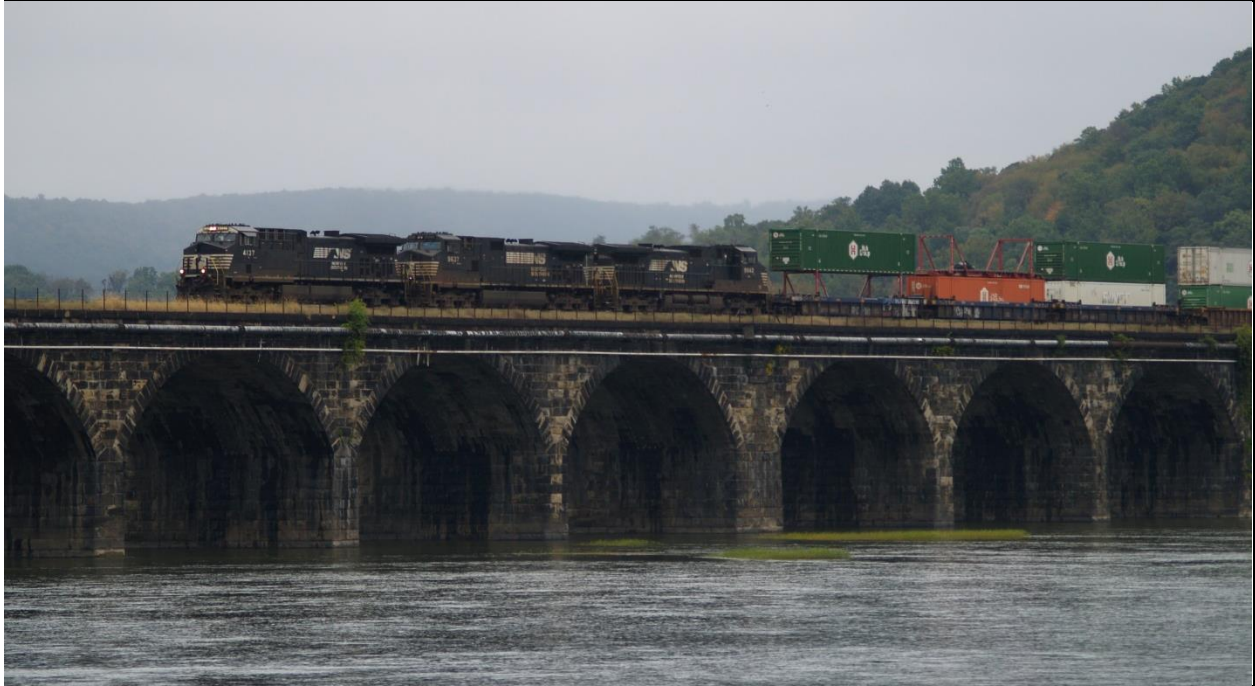
Norfolk Southern stack train crossing the Susquehanna River on the Rockville Bridge in Marysville, PA. The Rockville Bridge was completed in 1902 by the Pennsylvania Railroad and remains the longest (3,820 feet) stone masonry arch railroad viaduct in the world.