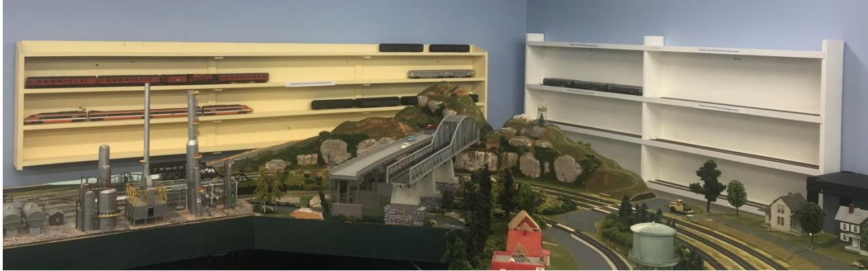
New shelving for Club passenger trains on the left and privately owned member rolling stock on the right.