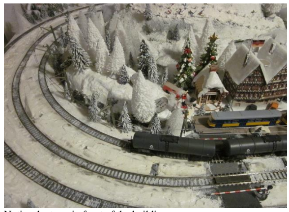
Notice the tram in front of the buildings.