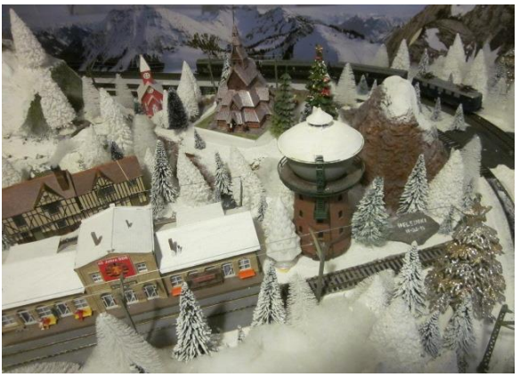
The church in the center background is a 3D puzzle building.