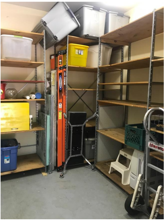
Club General Storage Room

If you didn't recognize them, it is probably because you have never seen the Club's storage spaces in a really useable condition. John Spach organized a clean-out session on Saturday, June 12<sup>th</sup> to sort, sift, repackage, restore, and reorganize the contents of the rooms. Unnecessary items were hauled to the dump (Two vehicles were required). The Club now has 1) a storage room dedicated to materials needed to put on train shows and 2) a second storage room dedicated to supplies equipment and train materials used for the general operation of the Club.