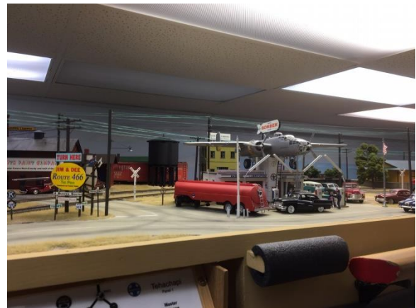
Bomber Gas Station

Here are the links to five videos of Jerry's Layout: Click to open.