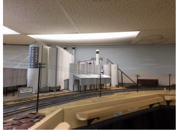
Monolith Portland Cement