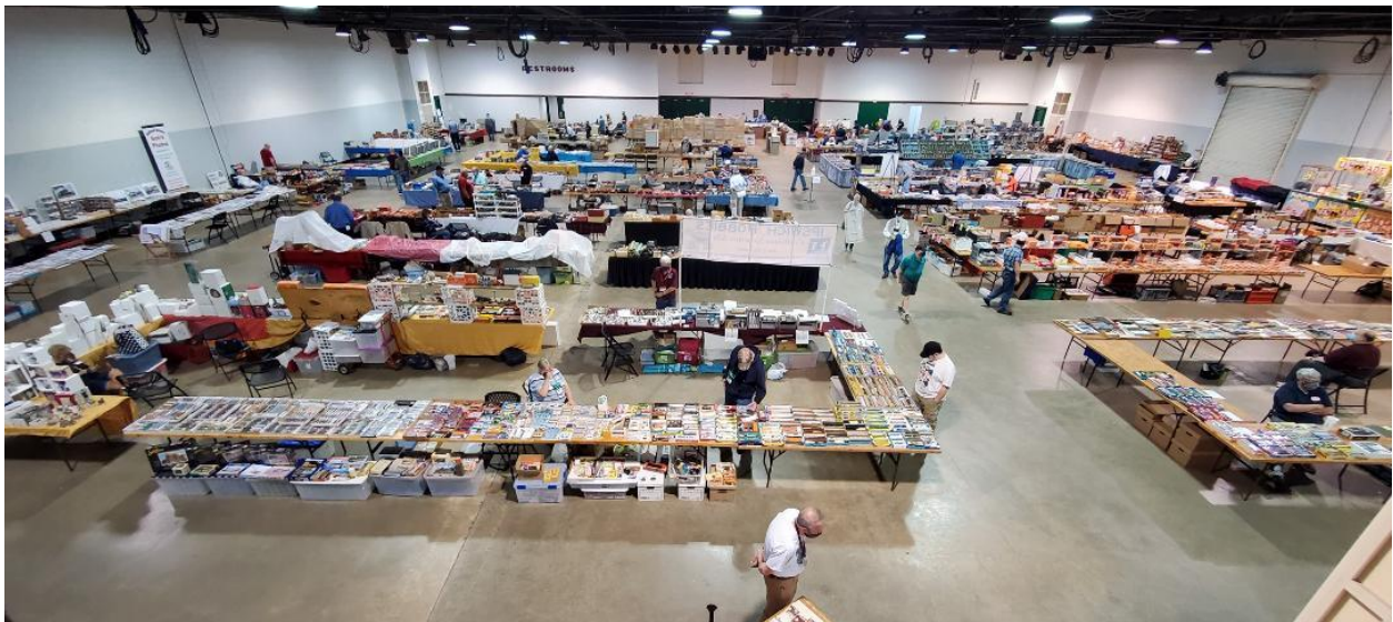
“God’s Eye View”